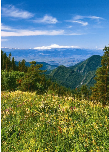
@ WWF Caucasus Programme Office

The Caucasus Hotspot is one of 34 biodiversity hotspots, the Earth's most biologically rich and endangered regions. The CEPF investment strategy for this hotspot supports conservation of five biodiversity conservation corridors that stretch across six countries.