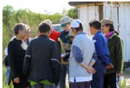
Running through the basics of CREW data collection with the new Mamre CREW group.