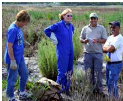
Chatting to the racecourse manager