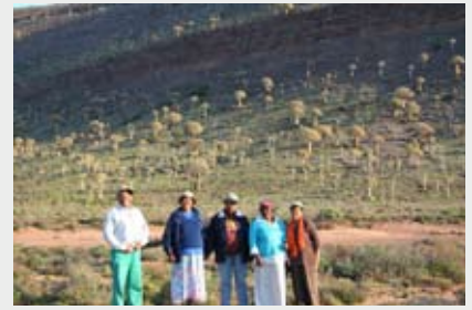
Representatives of the HFWG at the Kokerboom forest near Nieuwoudtville