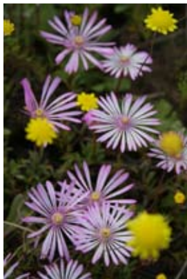
Assorted flowers from a typical spring display in Darling.

Outings have been few as I spent the whole of June on a wonderful holiday in Namibia where I spent a few days botanising in the south near Luderitz after the rains that fell there up to May. How about a Crew trip there sometime?