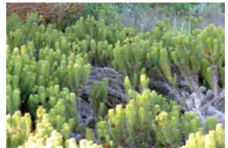
The multistemmed sprawling habit of Cullumia sp nov.

Forum field trip to Romansrivier and Grootvlei, two of the priority farms identified in the Upper Breede River Valley. About 75 participants joined us to have a look at some of the threatened plants recorded from those farms. The field trip gave us an opportunity to showcase the work done as part of the Tulbagh Renosterveld Project and to prove to the landowners that they had something special on their farms.