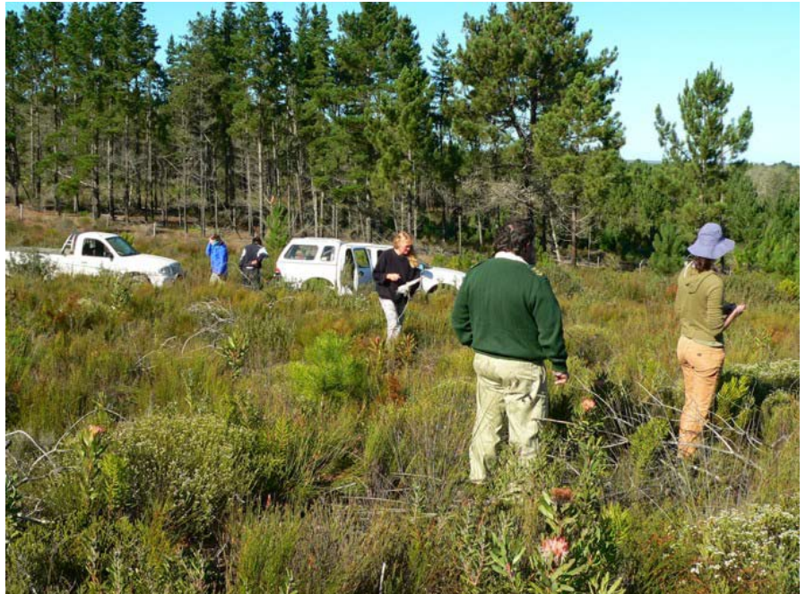
Still Bay and Albertinia CREW volunteers in the field near Albertinia