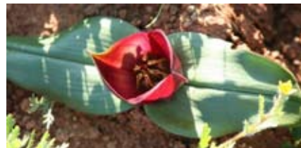
Androcymbium pulchrum , a species of which UCT scientists have been studying the pollination biology of this species and we've accompanied them on trips looking for pollinators.

The Nieuwoudtville Biodiversity facilitators are very enthusiastic about the work that we do. Our aim is to share knowledge with the community and we strive to look after