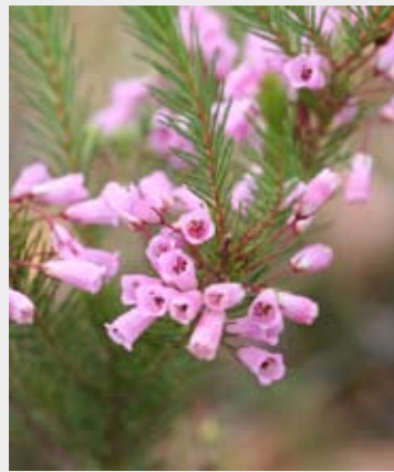
Erica filamentosa one of the threatened plants we found in the Bontebok National Park.