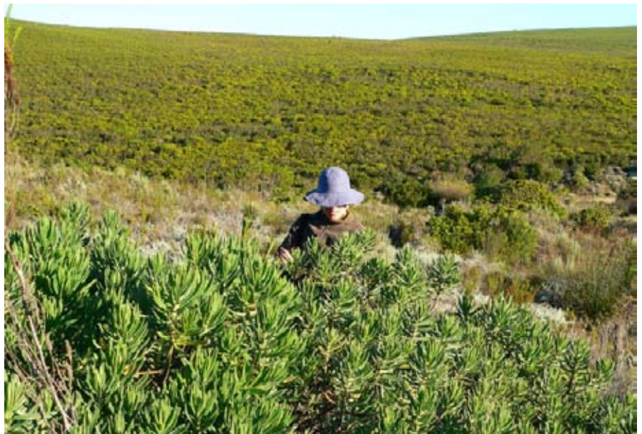
Tilla inspecting Lobostemon bellidiformis , sad to miss it displaying its spectacular red flowers

to monitor for CREW whilst pulling "rooikrans" in the reserves. WATCH THIS SPACE!