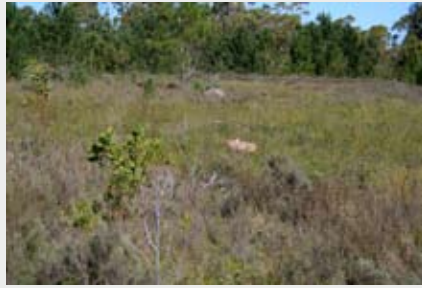
The unfortunate site of pigs grazing at endangered plant haven, Shaw's Pass, July 2006.

cracks and crevices in the granite boulders. The plant is about 10cm high with dark green linear leaves and little tubular white flowers. We were very interested to see whether this species did occur in the Caledon area. We checked the map and found the location of Mierkraal farm. As good model CREW volunteers we went to the farmhouse to get permission from the farmer and his wife happily directed us to their "speciale klipbanke". This sounded really promising. The site she showed us was really interesting. It was a shale outcrop along a stream running through the farm. The most striking feature was the hundreds of Nerine humilis on the shale outcrops. Unfortunately after an exhaustive search of the shale outcrops we could not find any Pauridia longituba . The farmer arrived with much curiosity and directed us to more "uitvalgrond" (land farmers can't plough because their tractors are not big enough) on his farm. We got to the site and it turned out to be an even more interesting shale formation. These outcrops looked like someone had run over them with a gigantic metal rake. Apart from having this fascinating geological structure we found some interesting species too. Trichodiadema fergusoniae and Cymbopappus adenosolens were among the species found at the site.