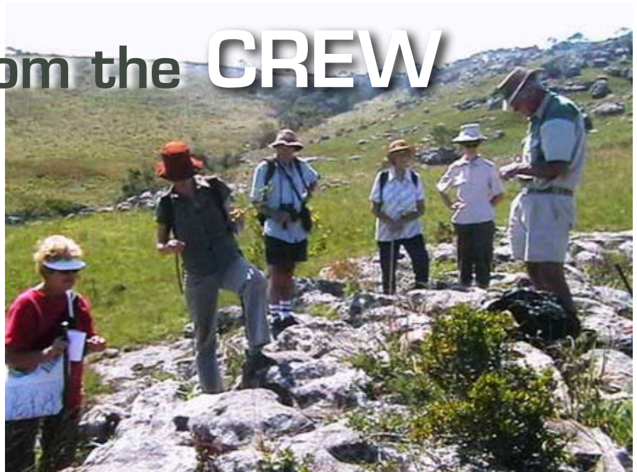
CREW fieldtrip in Pondoland with the Thursday Group.

We are making progress getting CREW working up North.