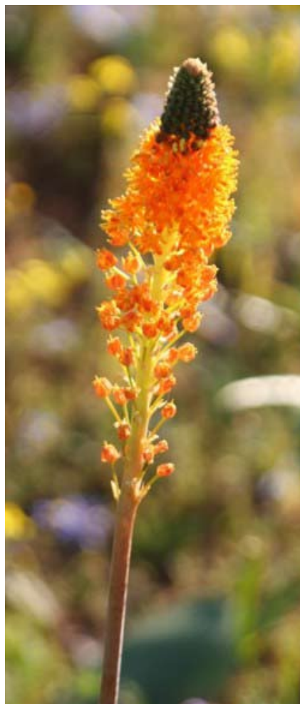
Bulbinella latifolia var. doleritica in flower for the first time in 12 years in the Nieuwoudtville Flower Reserve.

Visiting SANBI during CAPE conference and Ismail teaching the biodiversity facilitators how to use a herbarium during their visit to SANBI for the CAPE Conference