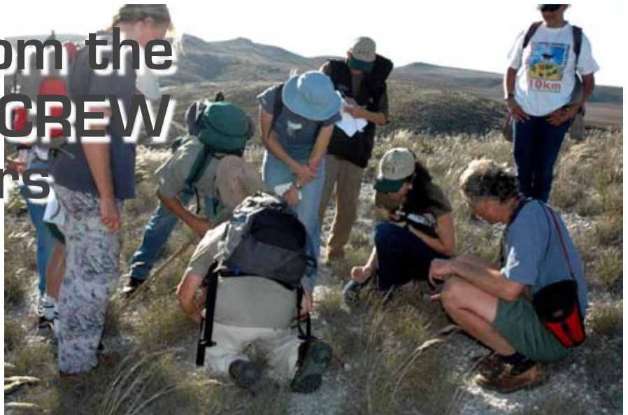
CREW workshop fieldtrip to Plaatjieskraal, Swellendam.

CREW has made its mark on the conservation community; this was quite evident at the recent Fynbos Forum. The CREW is not only renowned for finding threatened plant populations in the field but we might even have a shot at making it big in Hollywood! We were requested to do our infamous CREW superheroes play where we depict a bunch of oddball superhero characters out to save the charismatic and highly threatened Brunsvigia litoralis . The play was a huge success and we were assured that we would never hear the end of the superhero wise cracks. The positive side is that we will