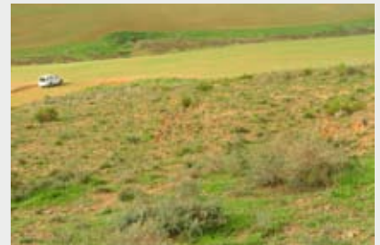
Interesting geological formations at the important fragment on Mierkraal farm.

On our way back we spoke to the farmer and hopefully he will fence off the area and keep his sheep off the site.