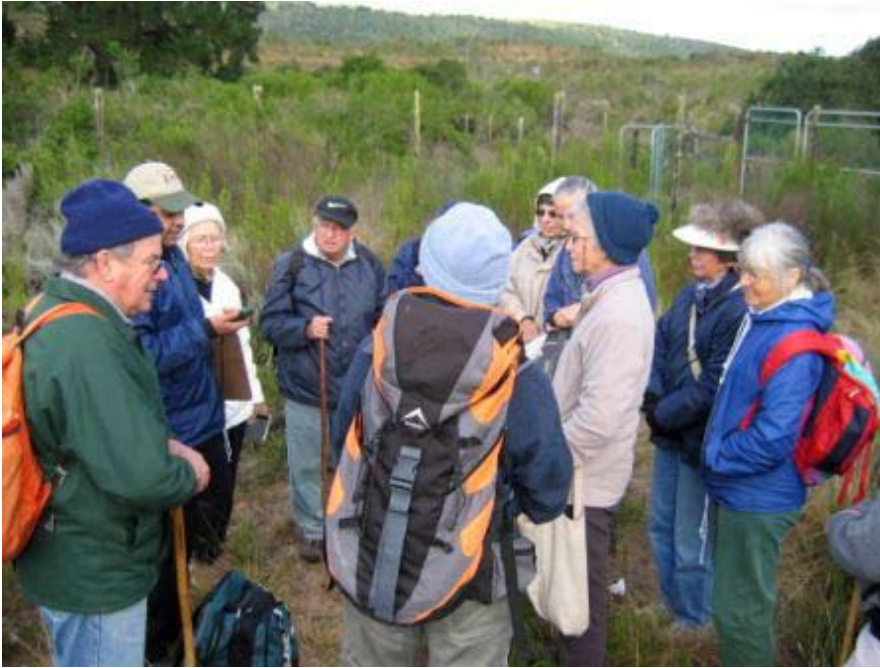
The reconstituted Outramps getting ready for a CREW trip