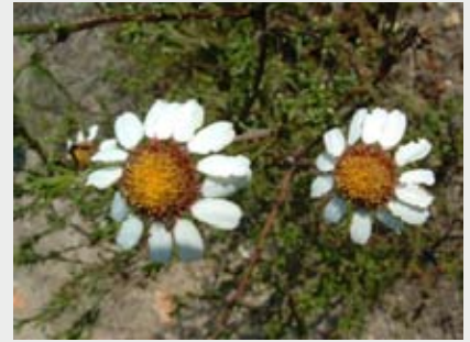
Cymbopappus adenosolens an endemic plant to Overberg Renosterveld in the daisy family, Asteraceae .