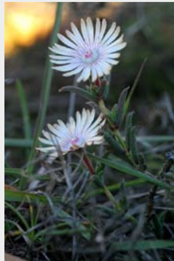
Trichodiadema fergusoniae one of the Overberg's special rare vygies.