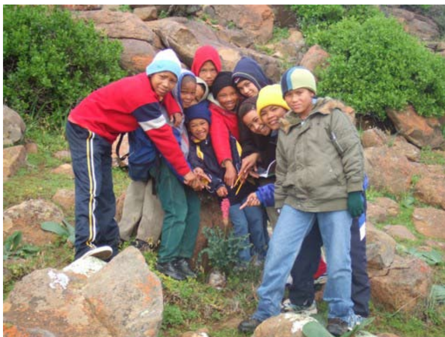
Nieuwoudtville Eco Club in the Nieuwoudtville Wildflower Reserve.