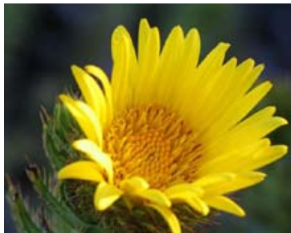
The bright yellow flower of Cullumia sp nov.

probably be remembered at Fynbos Forum as long as we attend the conference.