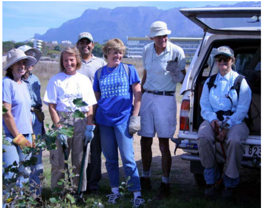
The KRIG ready to transport rubbish collected to the dump