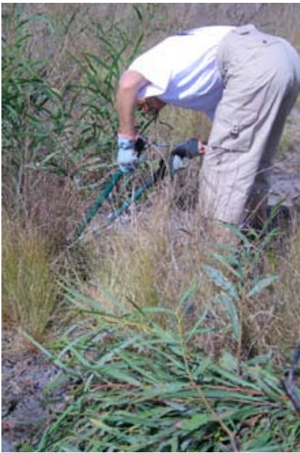
Hacking is hard work!