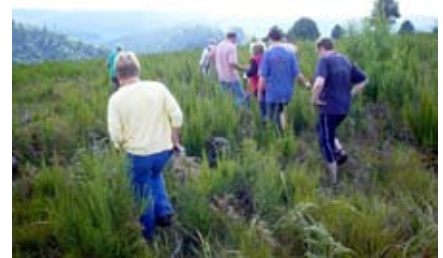
The Hogsback CREW group sampling a grassland fragment