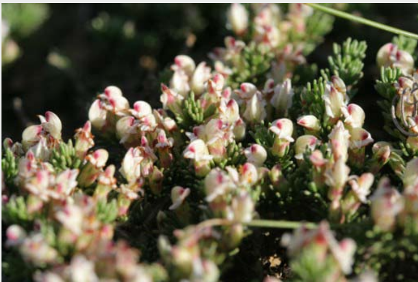
Aspalathus incompta a vulnerable endemic to the Ruens Renosterveld around Swellendam.