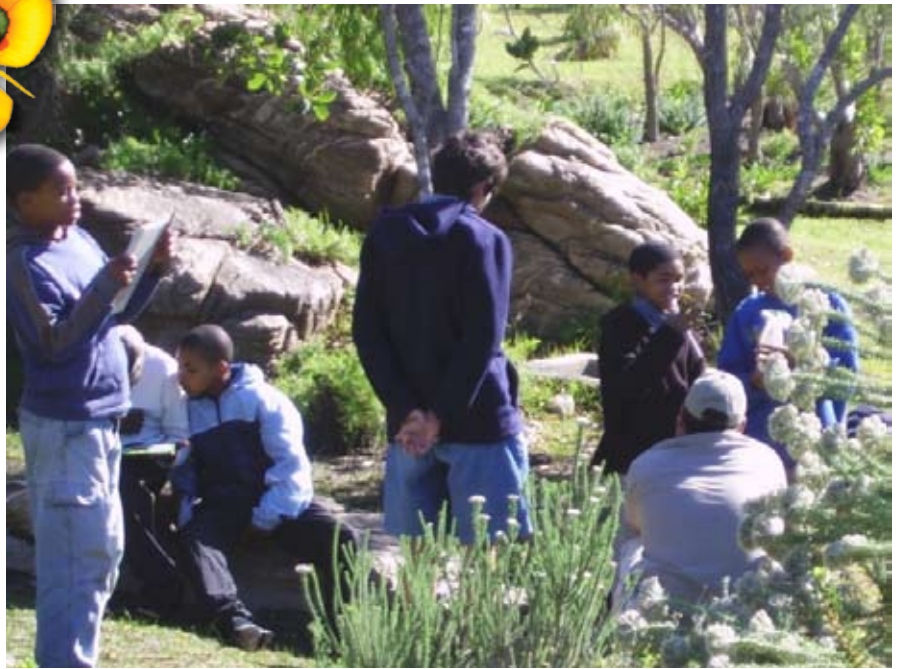
The St Francis eco-club in action in the St Francis community garden.