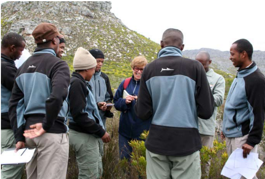
Identifying restios in the field at Silvermine with the Hoerikwaggo Table Mountain guides

to the best of our abilities using a key and dissection microscope where necessary. Our identification skills were truly put to the test by our 'friends' the Cape Reeds and we were kept on our toes with a few trick tasks — Els decided to have some fun by mixing in a few grasses and sedges in the list of 'restios' to ID! After the indoor session, a walk through the restio section of the garden helped our newfound knowledge hit home.