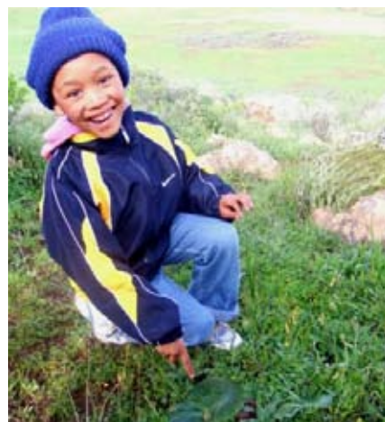
The joys of discovering hidden geophytes that grow flat on the ground.