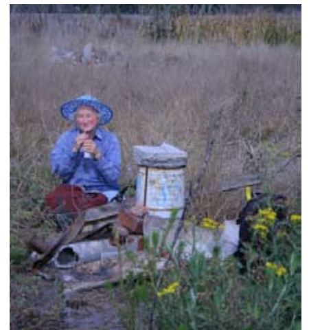
Tea break next to loot collected