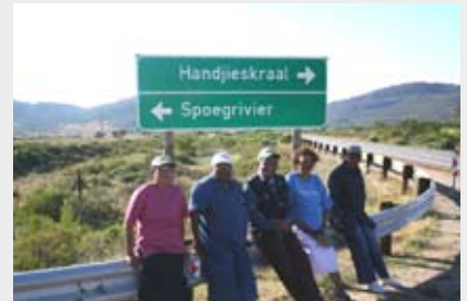
En route to Spoegrivier for more lesson sharing with local community members.