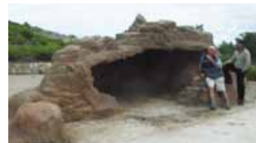
Tom Nel, left at the almost completed Rock Art Shelter, planting and final touches to come