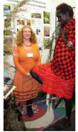
The most fascinating visitor

We took part in the “ Greater Good Giving Exchange ” in Cape Town in August (thank you if you voted for us!) – as far as raising funds went it did not! BUT it did force us to gather together our wits and motivate why we are necessary and important, in short clear one pagers. Below is what we felt was the most important. What we also learnt loud and clear is that very very few people see or understand the connection between a healthy and sound biodiversity and the welfare of people and animals. We spoke to literally hundreds and hundreds of people pouring through the marquee at the Water Front – there were only 3 Conservation oriented organizations there out of 60+ NGO's - most others were about saving children or animals, and they got the attention! We really do not grudge this, but what was upsetting was that even the organisers and facilitators of the event and the workshops the day before, simply could not accept that our primary concern was the environment - when so many babies and animals are dying – our contention “NO healthy environment = NO food or quality of life for Animals, Babies or any Life”, fell on deaf ears and we were strongly challenged for not doing something more directly for “people”! We feel we ARE a people-centred organization, that works with plants!? What do you think?