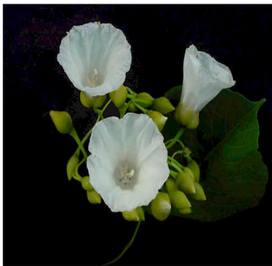
Figure 1. Merremia peltata flowers.

Merremia peltata is a stout subwoody twining plant (Fig. 1) that is distributed from Indian Ocean Islands and throughout Malesia and eastwards into Polynesia to the Society Islands. In the Pacific region of Polynesia and Micronesia, M. peltata can be a troublesome weed, capable of smothering trees up to 20 m tall (Fig. 2.).