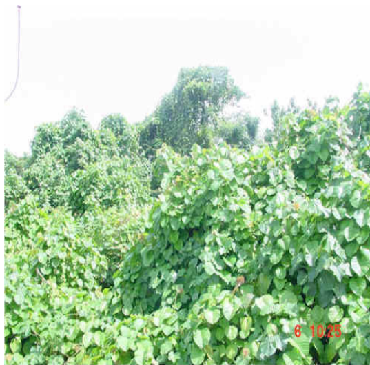
Figure 2. Merremia peltata smothering vegetation.

It was recently considered one of 24 serious weed targets for which it has been identified that biological control should be explored for Pacific island countries and territories. The objectives of this study are to: