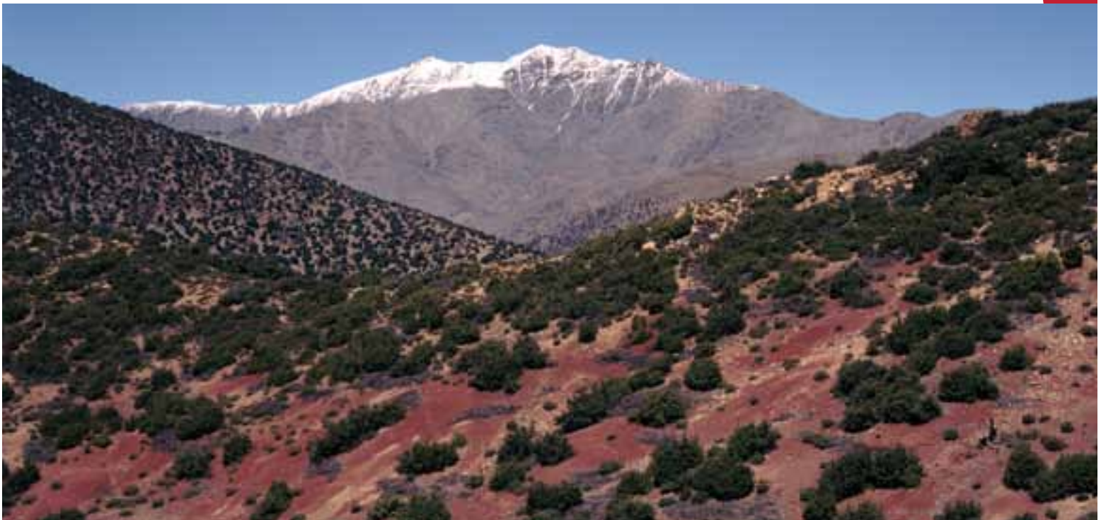
The High Atlas Mountains of Morocco

Currently, few funding organizations support civil society to play a vital role in the conservation of priority key biodiversity areas and the water basins where these areas are located. Most key biodiversity areas are inhabited by large numbers of people who rely on water and other natural resources. Civil society in the hotspot is positioned to take the lead in sustainable conservation within these sites, and it can effectively stimulate partnership between governments and the corporate sector toward conservation of biodiversity