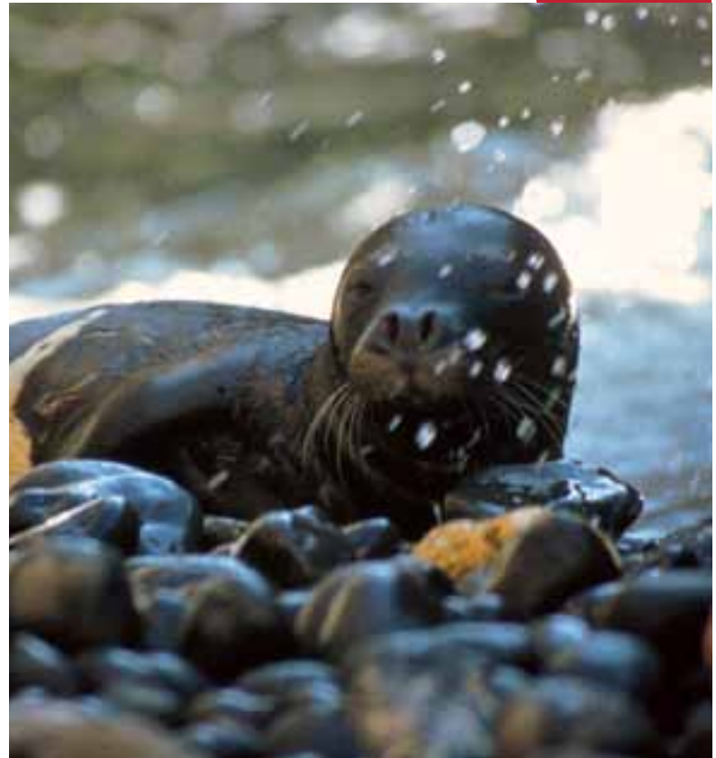
Mediterranean monk seal ( Monachus monachus)

In addition to its biological and geographic wonders, the region is a treasure trove of human history and culture. It is home to some of the world's earliest civilizations and the world's oldest sovereign state and first constitutional republic, San Marino, which dates back to 301 A.D. The first human civilizations (the ancient civilizations of Mesopotamia and the Nile Valley) occupied parts of the eastern Mediterranean Basin from around the fourth millennium B.C. The Mediterranean Sea gradually became both the central sea of Western civilization and the trade link to the riches of the East through the first millennium A.D. and the second half of the second millennium A.D. The residents of the region speak a multitude of languages, with the most common official language being Arabic.