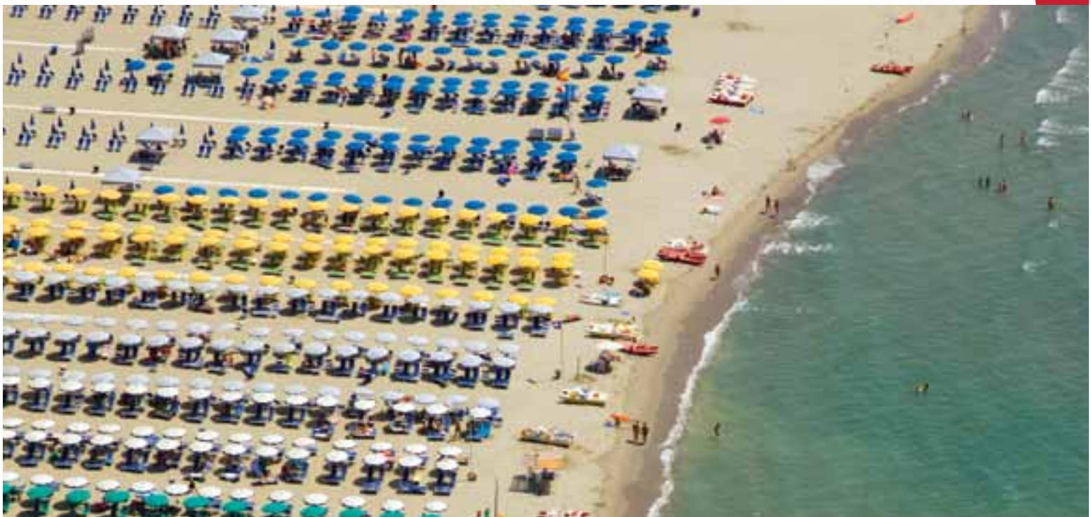
Meeting the demands of tourism, as shown in this image from Tuscany, and other industries place a significant burden on the region's natural resources, especially freshwater.

These predicted warming and drying trends have important implications for the conservation of the region's biota. The frequency of dry, hot days is conducive to fires, especially in the southern and eastern component of the Mediterranean Basin. Climate change is also a major concern because increased water demand together with a lower level of precipitation will result in the desiccation of streams, a habitat on which many of the endemic species are dependent.