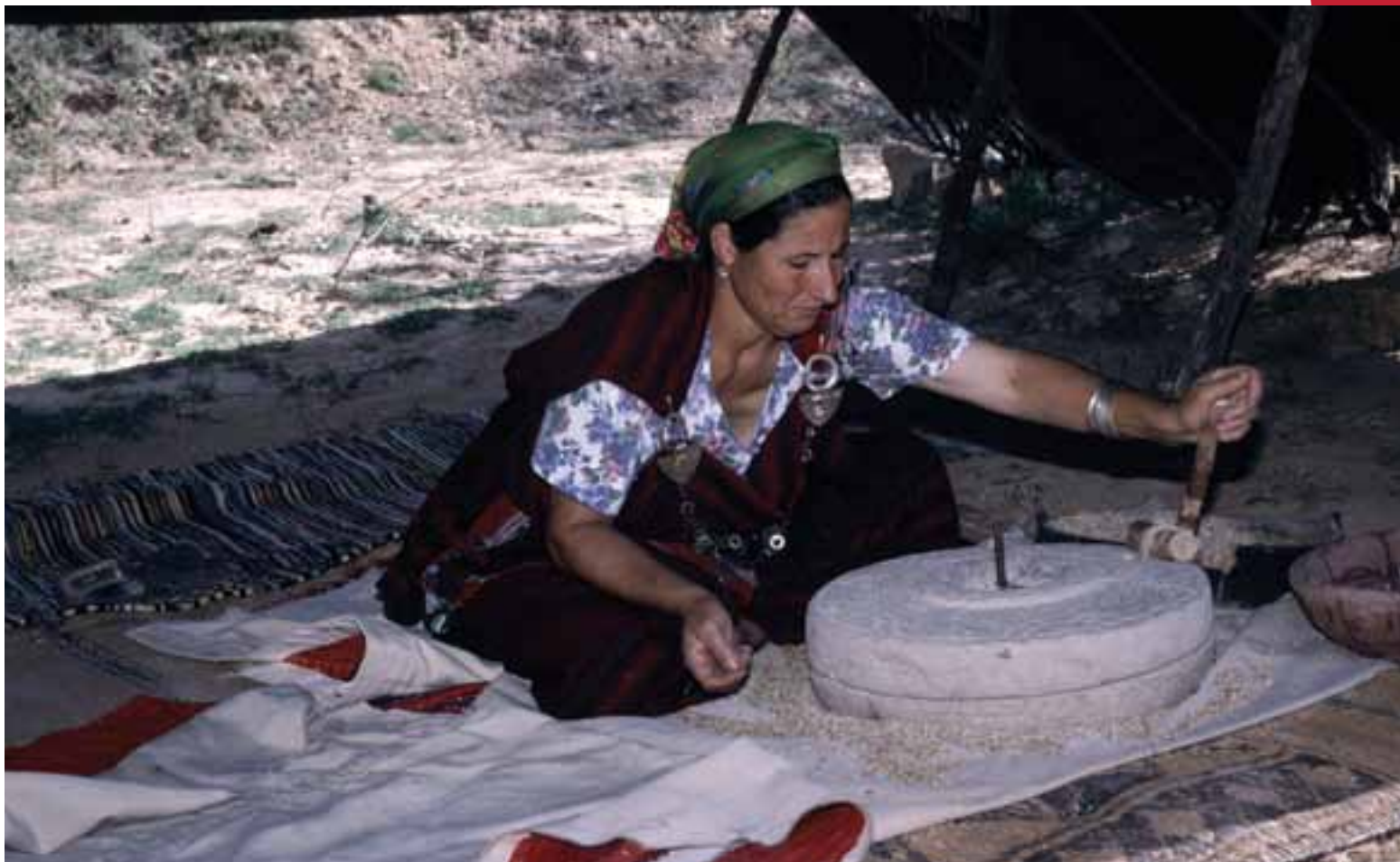
A woman mills grain by hand in Buoficha, Tunisia.

Its status as a hotspot, as well as the unique biological, economic and cultural importance of the Mediterranean Basin, led CEPF to create a conservation strategy for the entire region. The strategy, known as the Mediterranean Basin Ecosystem Profile, will guide CEPF’s highly targeted investment in the region—$10 million, to be disbursed via grants to civil society. But the profile, which was developed through the input of more than 90 organizations based or working in the region, is much more than CEPF’s strategy. It offers a blueprint for future conservation efforts in the Mediterranean Basin and cooperation within the donor community.