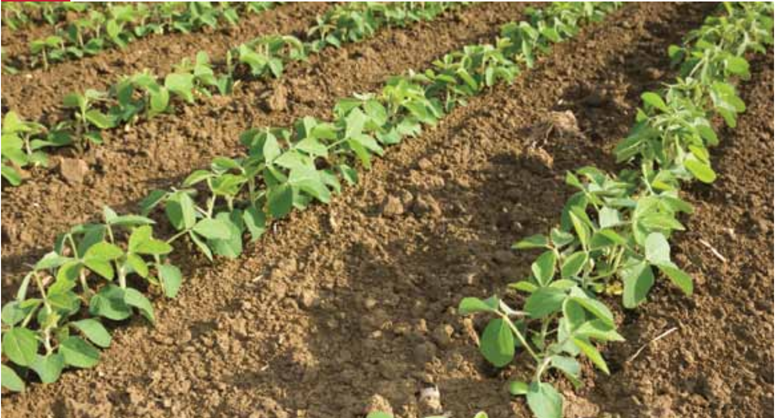
Soybean crop.

It also contains a five-year investment strategy for CEPF in the region. This investment strategy comprises a series of strategic funding opportunities, called strategic directions, broken down into a number of investment priorities outlining the types of activities that will be eligible for CEPF funding. The ecosystem profile does not include specific project concepts. Civil society groups will develop these for their applications to CEPF for grant funding.