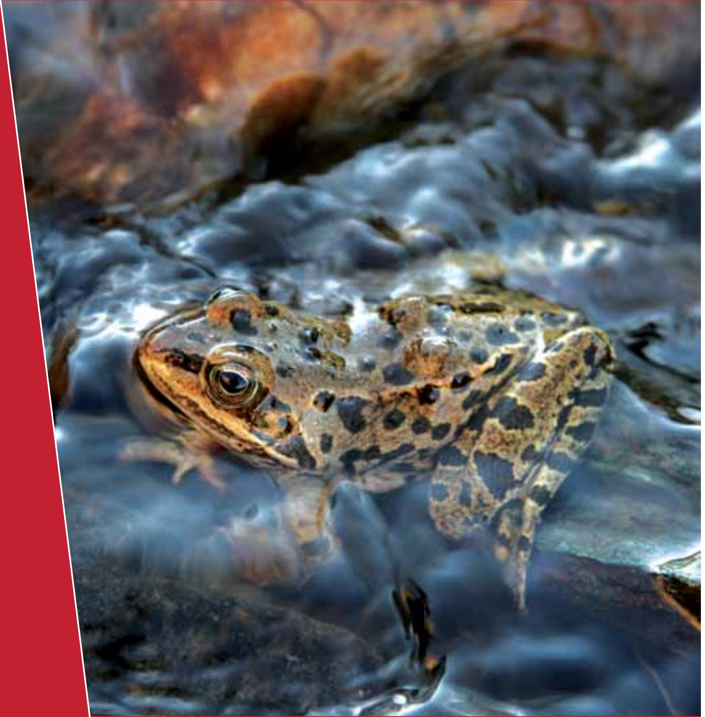
Turkish frog ( Rana holtzi)