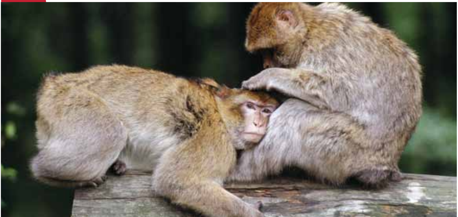
A Barbary macaque ( Macaca sylvanus ) grooms another. This is the only primate found in the Mediterranean Basin, where it is restricted to relict patches of forest and scrub in Morocco and Algeria.

Recognizing that most species are best conserved through the protection of sites where they occur, the profile's creators next pinpointed key biodiversity areas—sites important for the conservation of globally threatened species, restricted-range species, biome-restricted assemblages, or congregatory species—as targets for achieving site-level conservation outcomes. A total of 1,110 key biodiversity areas are identified in the profile, covering more than 40.7 million hectares, or approximately 19.5 percent of the land area of the hotspot (see map on p. 10). Of the total, 512 contain coastal or marine habitat, highlighting the importance of these sites for both terrestrial and marine conservation. In addition, 17 biodiversity conservation corridors were identified containing 435 of the key biodiversity areas. These corridors are essential for protecting the processes and links required to support threatened species, particularly in terms of long-term adaptation to climate change. The corridors are key to ensuring resilience of ecosystems so they can continue to provide essential services to natural and human communities, and they are considered most important for achieving long-term conservation results.