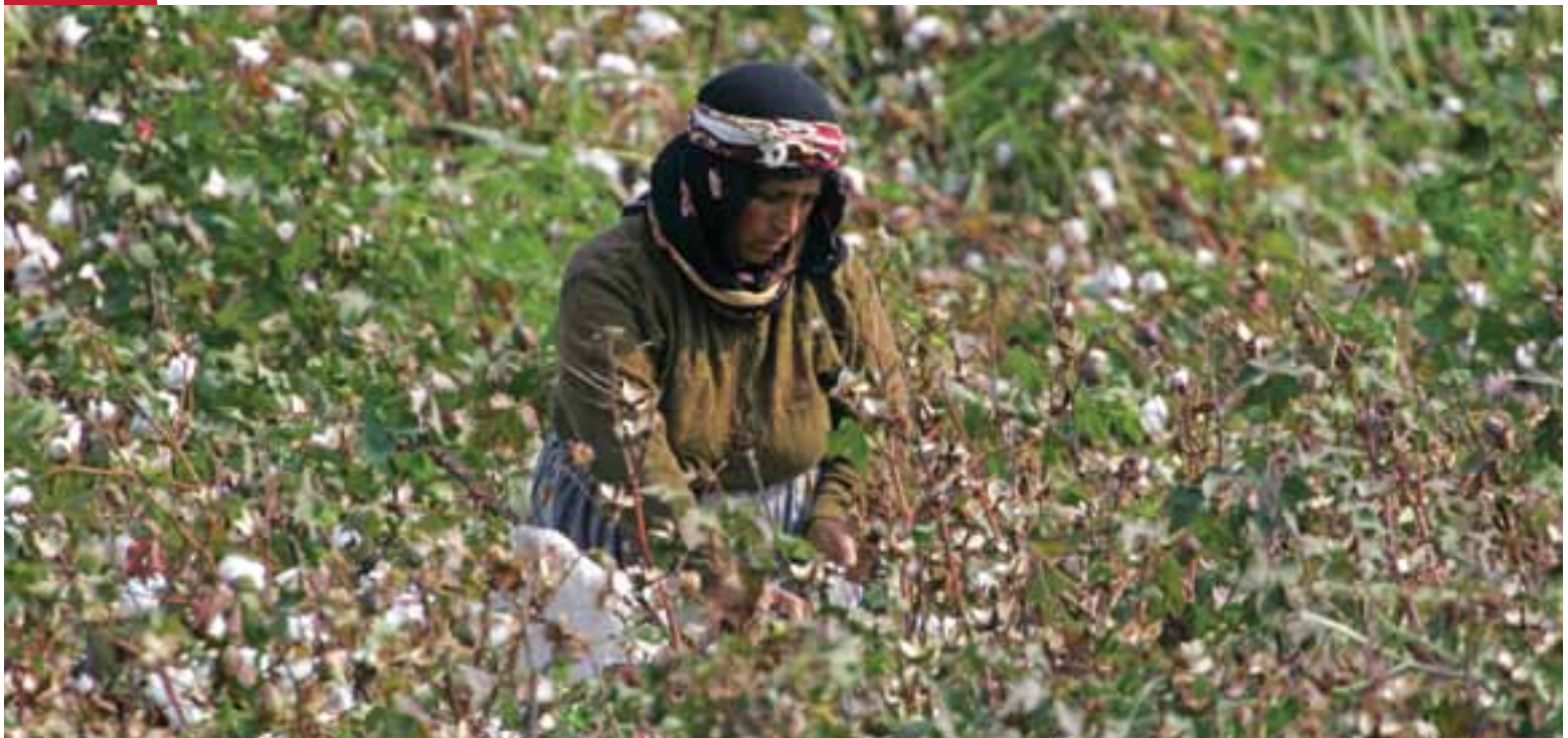
Irrigation-intensive activities, such as cotton farming, drain the basin's freshwater systems.

However, the geographical distribution of funds is not equitable. The EU funds target countries in the northern Mediterranean Basin, including the EU Macaronesian territories (Canary Islands, Madeira and the Azores). The other subregions—the Middle East, North Africa, the Balkan states and Cape Verde—receive support mostly from GEF and other multilateral and bilateral agencies focused on less-developed countries. They are also priority areas for some foundations and NGO investments.