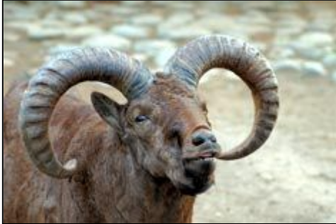
Caucasian Tur - a powerful creature.

The tur is a fascinating creature, a symbol of strength and pride. It inhabits such impenetrable and severe places that its stoicism in extreme conditions causes astonishment and makes it of great interest for study. However, tur, like many other large mammals inhabiting Georgia, is seriously endangered. It is difficult to survive under diverse human interference: the pressure of hunting, habitat degradation, destruction and fragmentation.