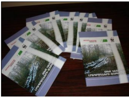
Some of printed material produced by Ecolur for the project.

In the final phase the Ecolur aims to have effectively functioning information network of eco-journalists in Armenia, which will transform mass media from passive observer to active participant of nature conservation projects. This network will ensure connection between civil society, governmental structures, nature conservation NGOs, donors