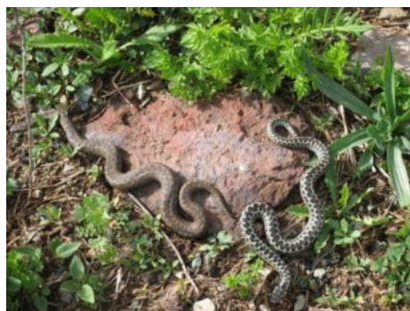
Vipera sp. found in northern Armenia.

The Institute of Zoology of the National Academy of Sciences of Armenia is conducting a project, which will include creation of database of rare species and those facing extinction in order to include them in the Red Book of Armenia. The grantee will update situation of amphibians and reptiles based on recent scientific researches. The special brochure with list of species and short information will be published for all interested parties. One of the important achievements will be the harmonization of local red book data with that of IUCN, which will give possibility to work on red list on various levels.