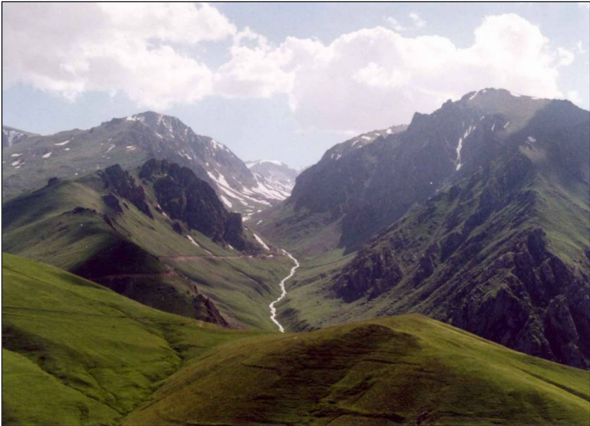
A view to the Zangezuri mountain ridge. New protected area Zangezür will be established here soon.