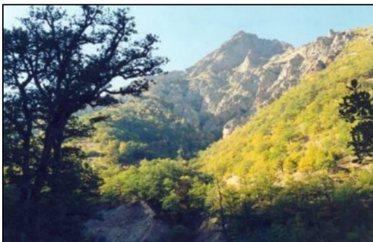
View to planned Arevik National Park.

which will be published after completion of the project.