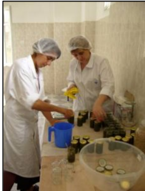
Processing of natural products prepared exclusively from wild plant fruits.

The rural population of the Caucasus owns a widespread tradition and knowledge in the use of medicinal and other wild plants. After the break down of the former system mainly subsistence agriculture, a growing demand for natural resources and a strong pressure on environment, as well as uncontrolled and illegal use of all kinds of nature resources can be seen all over the Caucasus. In order to regulate some aspects of medical plant use and standardize approaches Caucasus Wild Plant Certification Center (CWC), supported by CEPF, endeavored to conduct capacity building and preparation for national controlling and international certification of wild plants in Armenia, Azerbaijan and Georgia. This will include: creation of regional network of inspectors and provision of initial training;