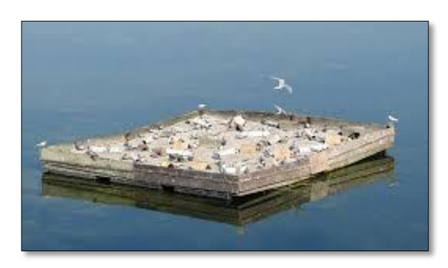
Figure 4 - Nesting platform example

for both colonially and territorially nesting birds would have an immediate impacts with some of the colonially birds potentially nesting in the area. Besides, this action would further forge the relationship with local fishermen in order to have them as our allies in our contribution for preservation and enhancement οf the area's biodiversity. Furthermore, the artificial platforms would serve also as roosting sites for wintering or stopover water birds. The presence of migratory, wintering and nesting birds might serve also as a good precondition for developing ecotourism activities during all year seasons.