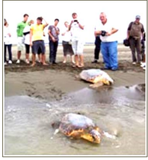
Figure 2 - Sea turtle in Patoku Lagoon<sup>2</sup>

Lagoon of Patoku is one of the Biodiversity Hotspots of Albania and is known for its regional (Mediterranean) and European Importance: it is one of the Specially Protected Areas of Albania identified by UNEP and RAC/SPA since 1996; it is an Important Bird Area (IBA) and it is one of the EMERALD sites of Albania. It is one of the most important wetland sites in Albania for waders (Order Charadriformes), and one of the two sites where Slender Billed Curlew (Numenius tennuirostris) has been recorded so far in Albania. Patoku lagoon and the estuarine waters between Mati river (in the north) and Ishmi river ( in the south) have become an hotspot area for Sea Turtles in the Mediterranean basin, being used as an important feeding place for the sea turtles, especially for Loggerhead Sea Turtle Caretta caretta .