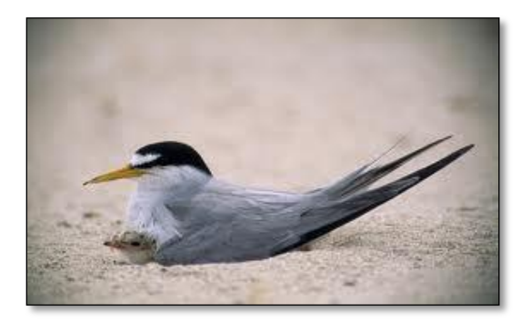
Little Tern Sterna albifrons

Several species of colonially nesting birds visit the area during spring and summer months but they do not nest there due to the lack of nesting habitats/sites to be available for those colonially nesting birds. Among them we would mention several species of terns including Common Tern Sterna hirundo, Little Tern Sterna albifrons, Gull-billed Tern Sterna nilotica as well as Black Tern Chlidonias nigra and Whiskered Tern Chlidonias hybridus.