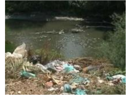
Figure 5 – Trash on streambed, Ishmi river<sup>3</sup>

Recyclable waste streams will be used from the recycling industry meanwhile other fractions will be safely disposed at regional landfill of Bushati.