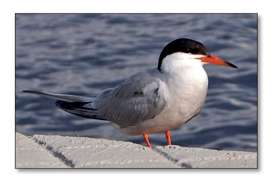
Common Tern Sterna hirundo

Usually, the above species prefer nesting on islands covered with sand, mud and shell debris and with sparse halophytic vegetation. This typical habitat is currently not freely available for nesting birds in Patoku lagoon. The existing habitats are both very near to the road and thus frequently disturbed by people or and with very easy access from mammal predators which could be detrimental for any bird colony.