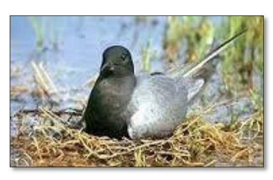
Black Tern Chlidonias nigra