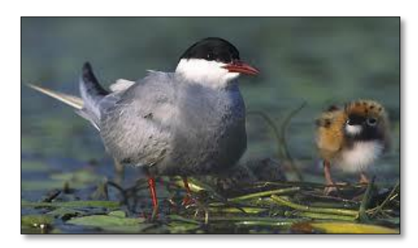
Whiskered Tern Chlidonias hybridus

Usually, the above species prefer nesting on islands covered with sand, mud and shell debris and with sparse halophytic vegetation. This typical habitat is currently not freely available for nesting birds in Patoku lagoon. The existing habitats are both very near to the road and thus frequently disturbed by people or and with very easy access from mammal predators which could be detrimental for any bird colony.