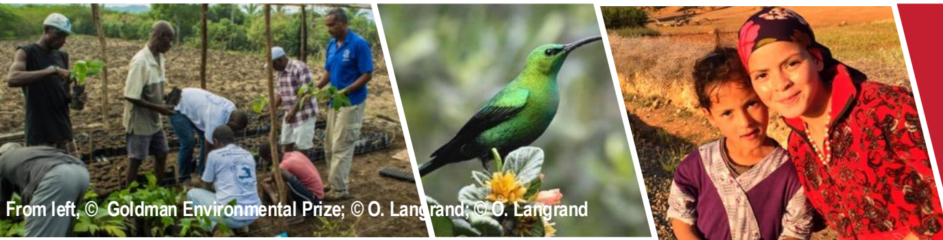
From left, © Goldman Environmental Prize; © O. Langrand; © O. Langrand

Active in 9 biodiversity hotspots. Since inception, conservation strategies implemented in 24 of 36 hotspots.