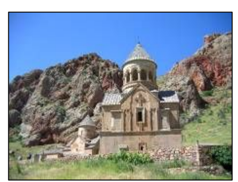
National Park.

Establishing of Arpi National Park will be even more important considering the fact that Georgia plans to establish "Javakheti" National Park which will border the Arpi from Georgia's side. Both parks will represent natural ecosystems of the region and provide safe cross-border paths for various animals.