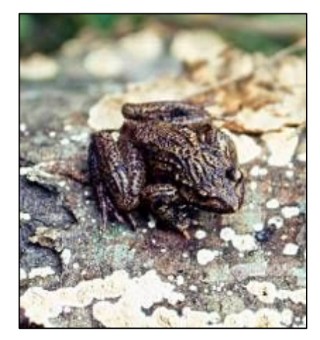
Caucasian mud diver.

Center for Biodiversity carries out project dedicated to support of protected areas for improving protection of priority amphibian species - Caucasian toad ( Bufo verrucosissimus ) and Caucasian mud diver ( Pelodytes caucasicus ) in Azerbaijan. These species are included in the red books of Azerbaijan, and IUCN. These species are extremely sensitive even to the subtle anthropogenic influences. At the same time, the local