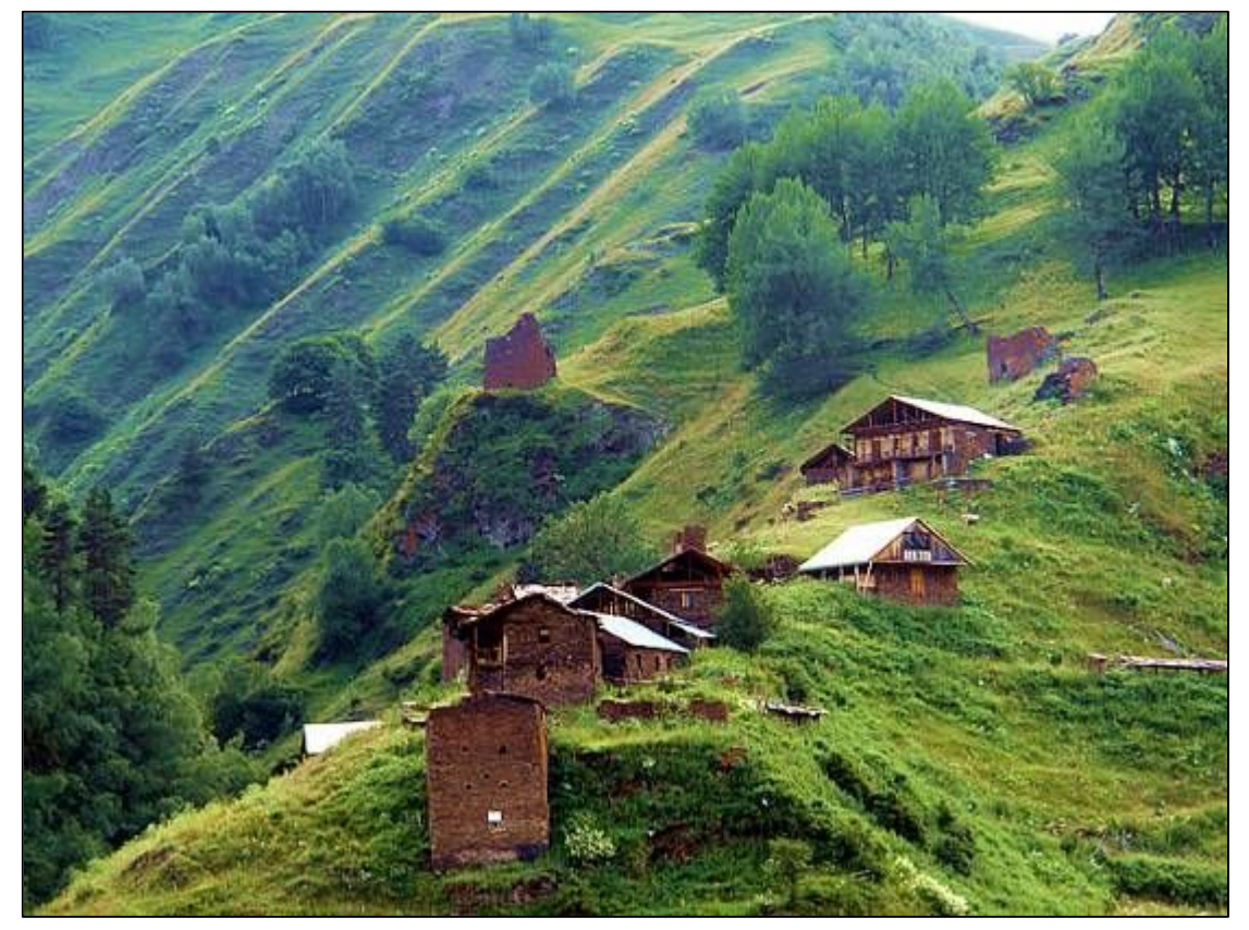
Vil. Asalgori situated near Tusheti National Park, Georgia.