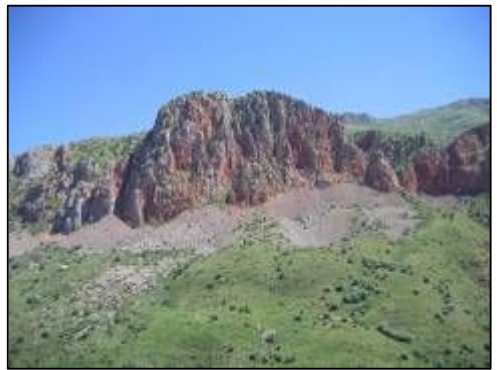
View to planned Arpi National Park.

NGO - "Biodiversity and Landscape Conservation Union" conducted a feasibility study on establishment of national park in south-east Armenia. In order to evaluate this many specific aspects of prospective area has been reviewed. In the fist place the detailed analysis of local flora and fauna, social and cultural background and other specific regional features was carried out. All the research was conducted in close cooperation with Department of protected areas, institutes of botany and zoology of the Armenian Academy of Sciences, local administration, stakeholders and other