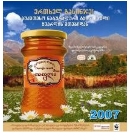
Poster showing ready product.

economical and nature conservation benefits in a model community – Kvareli, situated in the eastern part of Georgia. The NGO has set up pilot honey production farm, which is already producing fully marketable products. Significant part of this project is dedicated to promotion and advocacy of sustainable honey production on regional and national levels. Additionally, Durujis madly has established Biodiversity Fund for Kvareli and part of the revenues gain by honey marketing will be directed to this fund.