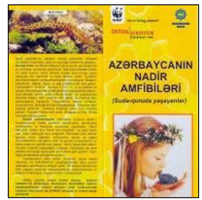
Advocacy leaflet produced for the project.

amphibian species; investigation of distribution area and mapping of dwelling places; preparation of action plan for ensuring protection of these species; raising awareness of local population on the importance of amphibians. The action plan will be presented to the Ministry of Nature Protection of Azerbaijan for further actions.