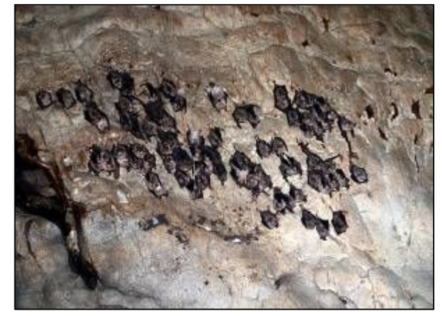
Colony of bats in the cave.

Protectors Union. The project will input significantly in conservation of all globally significant bat species in the Caucasus hotspot. This will be achieved through: capacity building of experts and volunteers involved in monitoring of bats; compiling key habitats database for each of the globally threatened bat species; elaborating regional conservation action plans; initiating of establishing model protected area in the region, to demonstrate approaches to effective conservation of key bat species and their habitats. The project also envisages production of various popular materials for raising public awareness on importance of the bats species and their habitats.