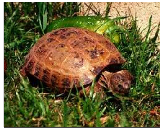
Common tortoise – rare species in Russia.

Interregional community organization - "Russian Botanical Society" (Dagestan Branch) carries out project dedicated to conservation of intraspecific diversity of Common tortoise ( Testudo graeca ) in the Russian part of the natural habitat. These objectives will be achieved by: evaluation of number and spreading area of tortoise populations; revealing of main factors influencing number of populations in order to work out measures for territorial protection; conducting public awareness campaign in local population; prepare recommendations for establishing of protection territory dedicated to