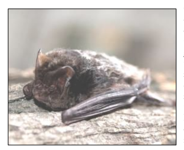
Western Barbastella – Barbastella barbastelus.

Conservation of the Earth's biological diversity is one of the major problems in the planet's sustainable development. Biodiversity conservation is a basis for the humanity's well-being. This accounts for the growing support recently offered to practical efforts targeted at biodiversity conservation. One of the key issues in this direction is support to civil society efforts to promote transboundary cooperation and improve protected area systems. Keeping in line with these important initiatives the CEPF grantee - Field Research Union Campester is conducting project to develop and build capacity of bats transboundary monitoring network in the Caucasus. Cheiroptera are one of the most diverse classes of mammals in the Caucasus. The comprehensive approach to the protection of Caucasus threatened Cheiroptera