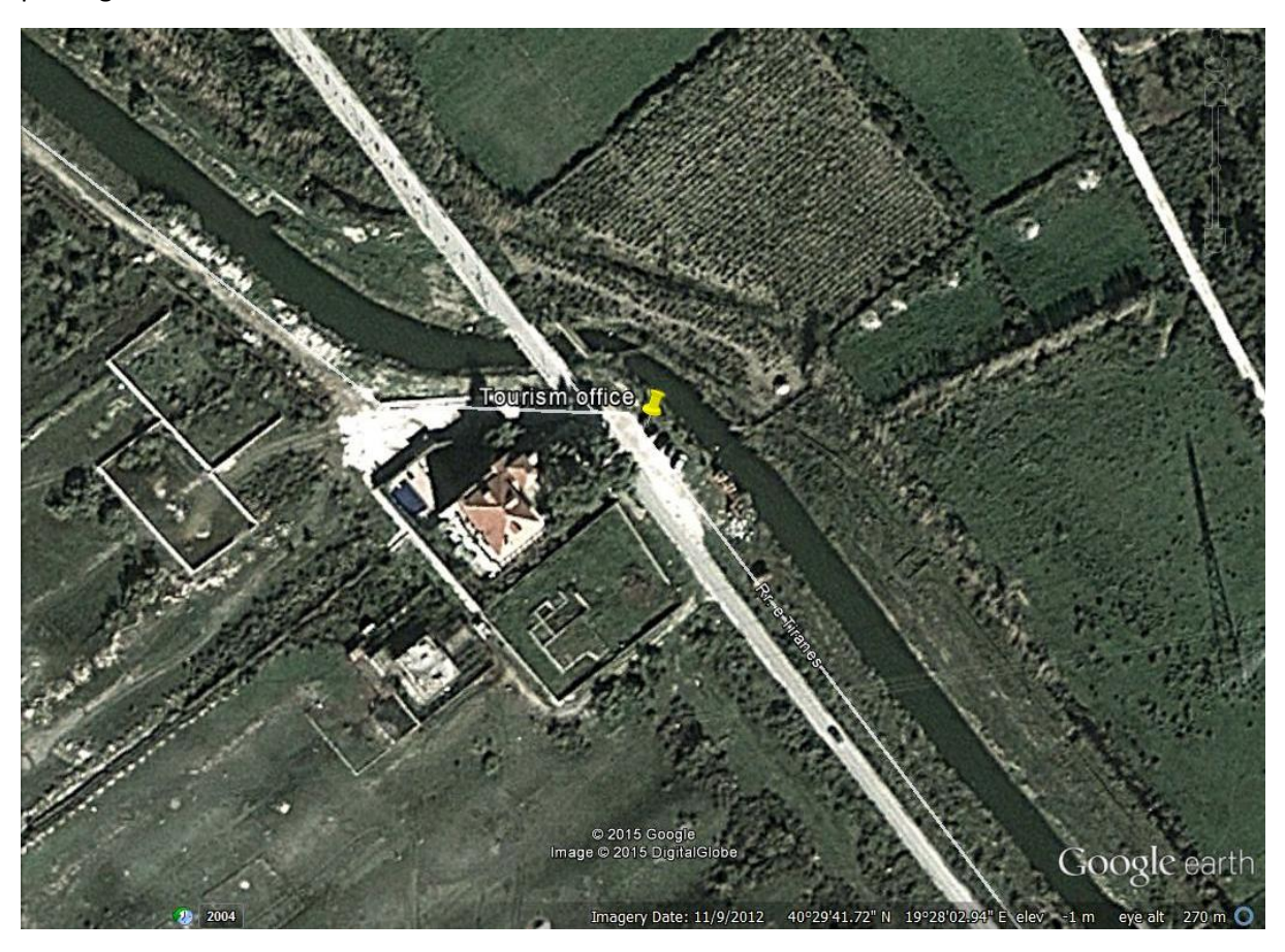
Fig 1. Point where the object will be placed.

The object will be placed in a venue along the main entrance to the KBA, which currently serves as a parking for cars.