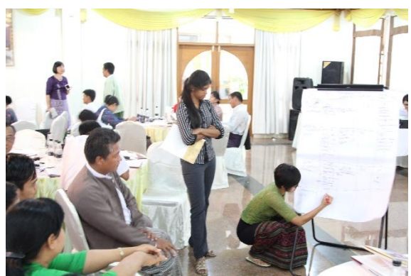
Group exercise on training need assessment on impact assessment and biodiversity and ecosystem services valuation