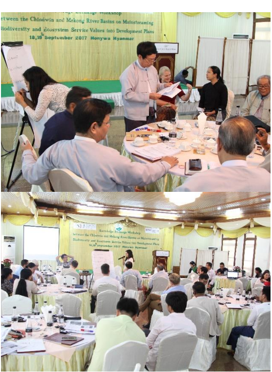
Group work on exchanging knowledge on valuing ecosystem services