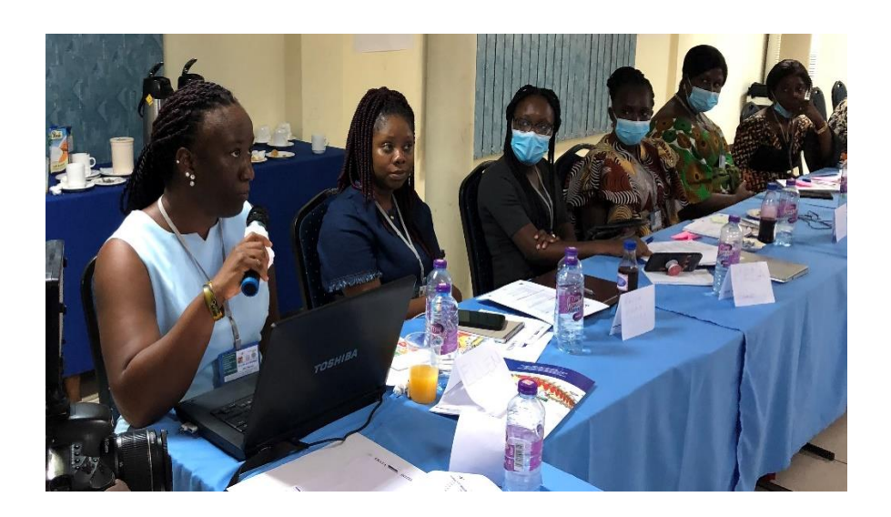
Participant from Sierra Leones engaging the keynote speaker at the workshop in Accra, Ghana