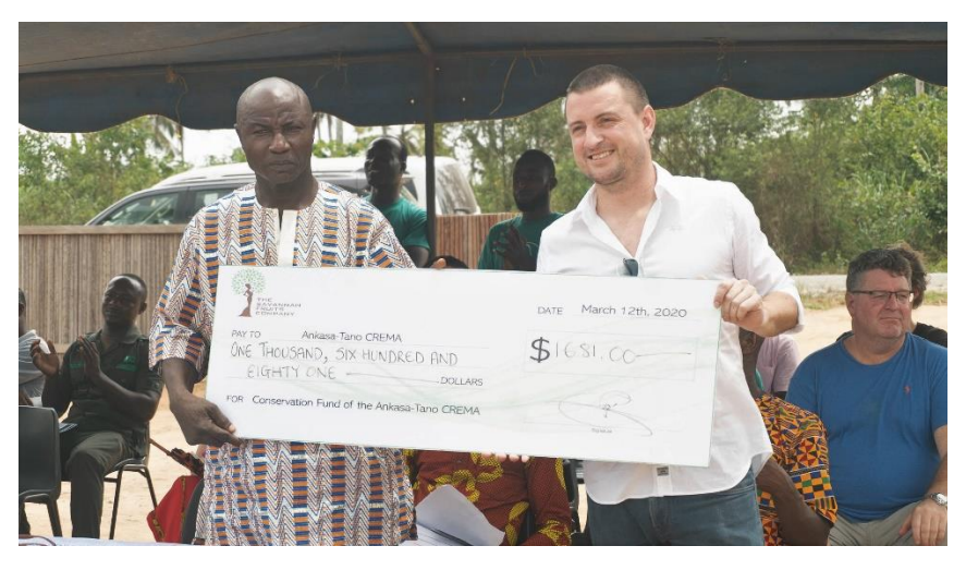
Figure 4: First Conservation Premium paid by SFC and received by the Ankasa-Tano CREMA Chairman

the conservation fund in 2020. The next settlement covering both 2020 and 2021 premium should bring about 1,700USD on the Conservation Fund.