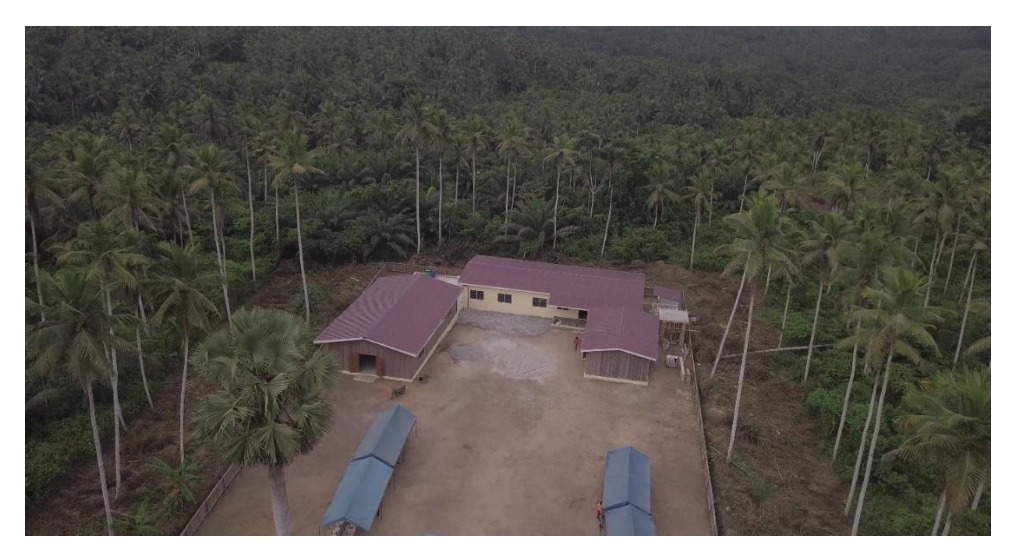
Figure 3: Aerial view of the Ellenda VCO processing centre after completion (2019)

made on logistics and budget, Modern Planners was selected for the work. The construction was completed at the end of 2019.