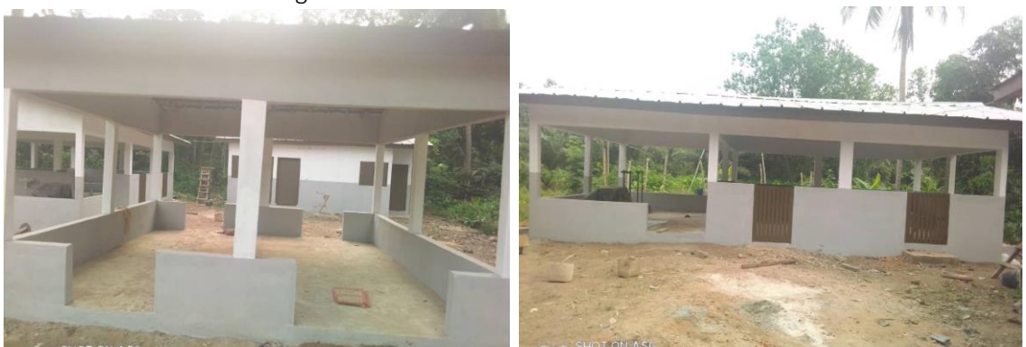
Figure 6: General view of the Gari processing unit (left) and view of the humid and dry areas (right)

This processing unit was built in 2021 and include a peeling shed, a humid area with shredding machines and presses, a dry area with improved stoves, an office and storing room. The centre is yet to be connected to the national grid but it does not