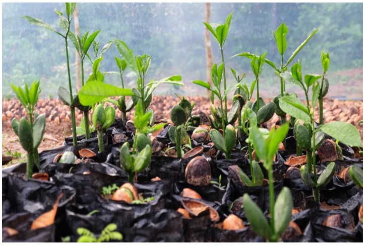
Figure 1: Collected Baku seeds germinating in nursery

Throughout the project the agroforestry share increased considerably for farmers got more and