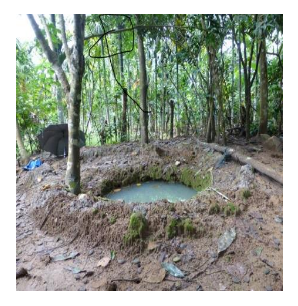
Water source in a Paniya Kaavu

The trees in the Kaavu should have 'milk'<sup>4</sup> because their deities like milk and should also provide proper shade to their deities. But then there were some old Kaavus which had no trees/no shrubs/no water source-simply a 'stone' in a grassland!