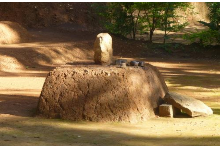
A Kattunayakan Kaavu with no tree

In Paniya Kaavus, there are rules about no collection of firewood or other produce from the Kaavu because everything belongs to the deities. These rules are flexible sometimes. Dry firewood can be taken with deities' permission. However during the puja, everything required like firewood and