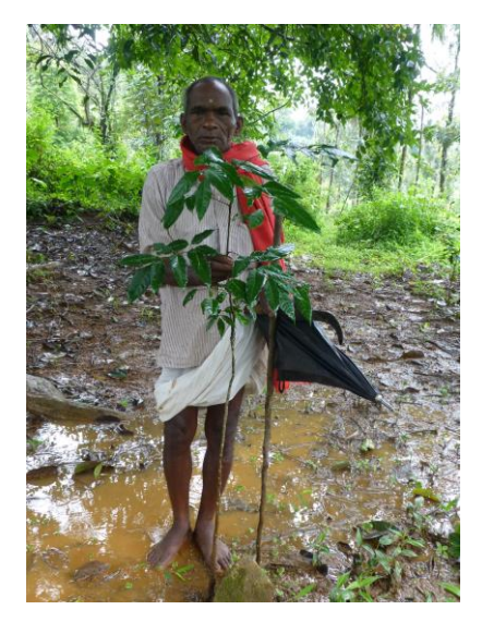
A mango tree planted in the Kaavu

Belief Systems : This wasn't part of our framework but we came across them and think these are worth documenting. Both Paniya and Kattunayakan Kaavus can have more than one deity and all deities are distinct from each other in terms of their roles, significance and requirements. Narayinamma , for example, provides strength to the Paniyas and is called when there is a health problem. Similarly, Chorian is called when there are skin allergies. Ther resides in the forests and protects the people. Thambiratti cannot be offered chicken. Women cannot go to Kaavus dedicated to Kuttichattan . And so on.