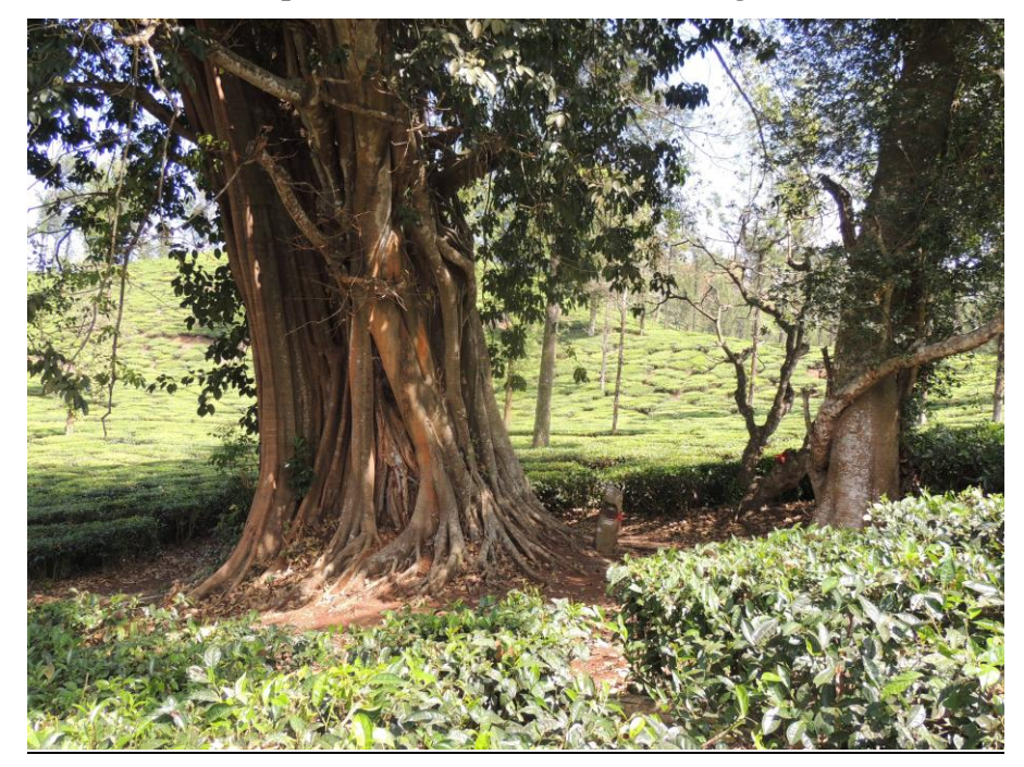
A Paniya Kaavu in the middle of a tea estate

This explained why an area of 5-15 cents for a Kaavu has often not been termed encroached. There have been some instances where the area around the Kaavu is owned by the Karnavar and has been planted with tea/coffee with a small space of 5-10 cents for the Kaavu. In the village of Elamanna, the Paniyas owned land jointly with the Chettys. They sold all their share to another non adivasi except 5 cents for the Kaavu. However, in such cases, as the land is owned by the Karnavar, there are no restrictions on the use of space all around the Kaavu during the time of festivals.