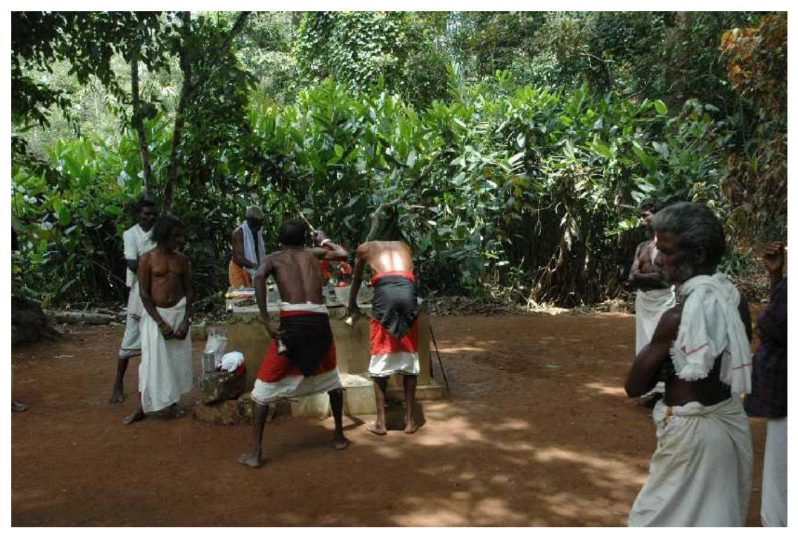
Kaavu festival in progress in a Paniya Kaavu

after the last Karnavar passed away, elephant problems in the village escalated. They felt that the cause was the fact that they had ignored their Kaavu. Then they started celebrating their Kaavu festival again which sorted out their problems. We asked some people if the fact that Kaavu festivals were being discontinued implied that their cultural significance was declining. We were instead told that several times in the past people have restarted their Kaavus when new issues started to come up, the cause of which they felt was the abandonment of their Kaavu.