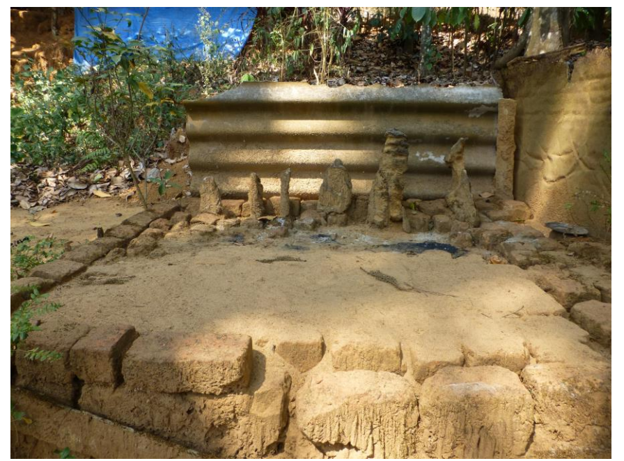
In Glen Rock, the Kattunayakans believe that the stones are growing in size every year.

We came across some stories of faith in the Kaavu deities. In Glen Rock we were told that the stones in the Kaavu had been growing in size every year. We learnt later that in Thanjora, people believe the same.