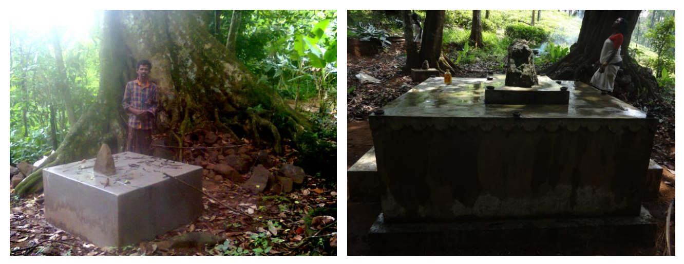
Donation of shrines by non adivasis as a symbol of respect for adivasi deities is also happening