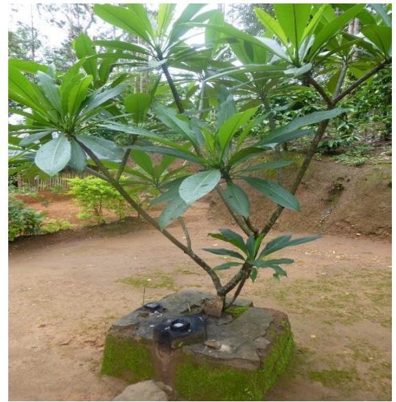
A new Kattunayakan Kaavu

Kaavus that were started recently are not necessarily new. Sometimes when deities from an old location are called to a new location, it has not been classified as a new Kaavu.