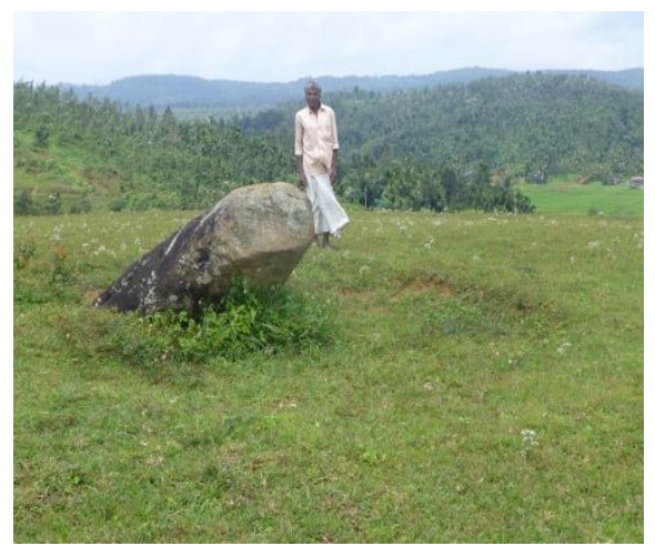
A Paniya Kaavu with no trees

The trees in the Kaavu should have 'milk'<sup>4</sup> because their deities like milk and should also provide proper shade to their deities. But then there were some old Kaavus which had no trees/no shrubs/no water source-simply a 'stone' in a grassland!