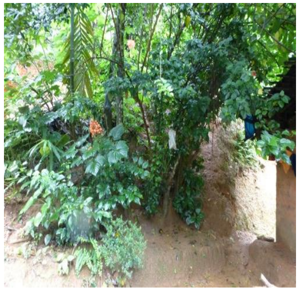
A new Paniya Kaavu

Age: Around 80% of the Kaavus we surveyed have been there for generations. It has been an interesting observation that 20% (which we think is not a small number) Kaavus were started recently (between 1-20 years) which we shall refer to as 'newer' Kaavus for future reference. What this could mean is that the process of starting Kaavus is an ongoing one and did not stop some generations ago as the word 'sacred groves' has come to typically suggest. New Kaavus are more common among the Kattunayakans.