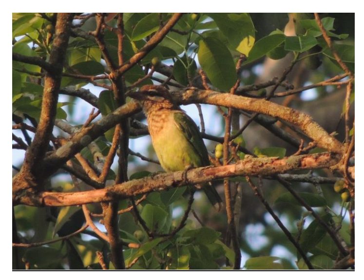
A barbet on a fig tree in the Cholady Kaavu