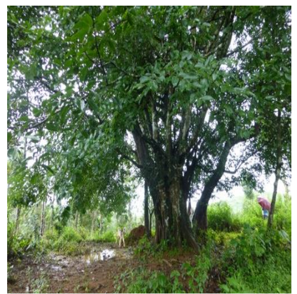
A Big and old tree in a Paniya Kaavu

which in turn provided the habitat to several other life forms, was believed to be ideal locations for their "deities". Paniya Kaavus which have been there for generations usually have big and old trees with reasonably good canopy cover, very often with water sources like a small pond or a thin stream. The water source is either natural or man-made but it is quite important for most Paniya Kaavus to have water for their deities.