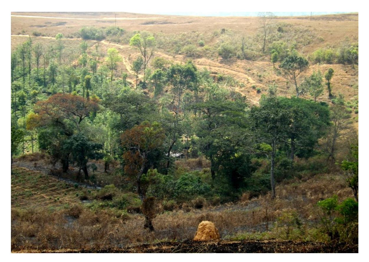
New tea being planted around the Kaavu in Panjakolly

her deity to Chetty's land and has been doing puja there. However she is not very happy about the present location and wants to reclaim her old sacred space. She got the volunteers during the mapping exercise to mark an area of 25 cents around her old Kaavu, which she is planning to fight for. The Chettys have promised to support her in her fight.