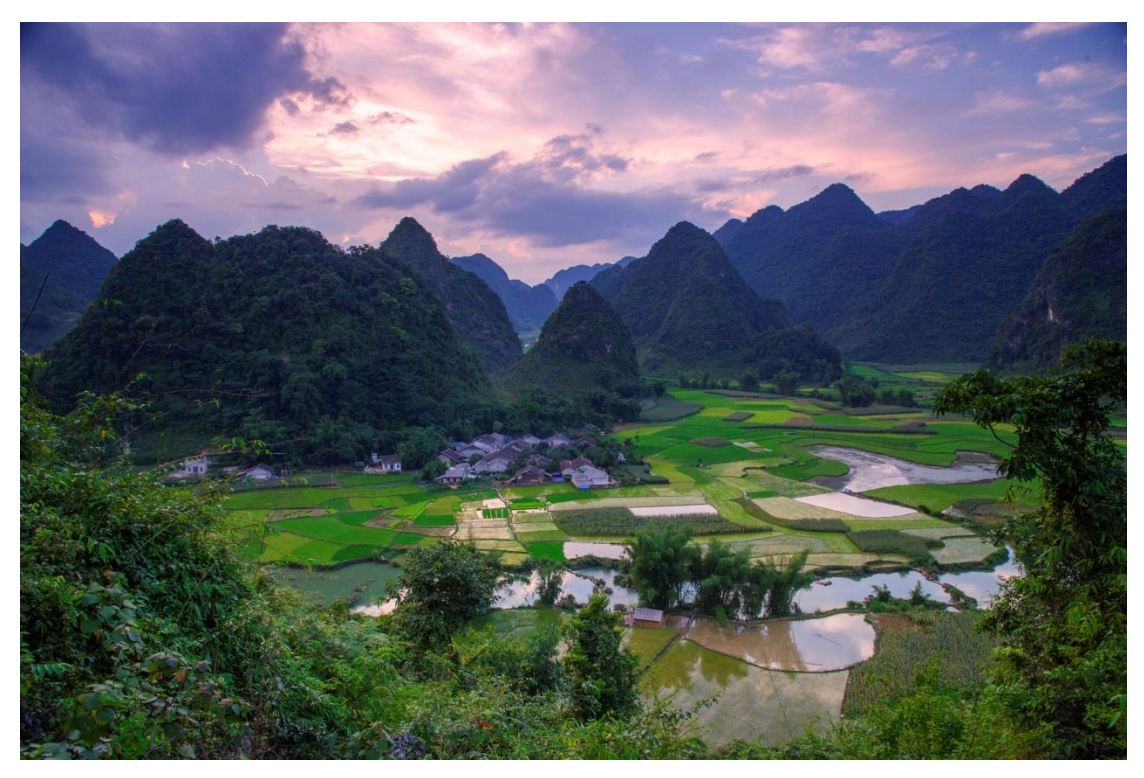
Cao Vit gibbon Species and Habitat Conservation Area, Trung Khanh