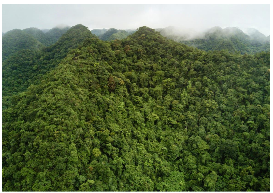
Trung Khanh, CVG SHCA.

Ngoc Con, Ngoc Khe, and Phong Nam are three communes living adjacent to the Trung Khanh SHCA. These three communes have total 28 villages and 1,545 households consisting of 7,530 people. These communes are largely populated by the Tay ethnic minority with 91.38%, following by Nung people with 8.46%, only 2 are Dao and 3 are Kinh people (FFI data, 2015). A full breakdown of the number of households and people in villages closest to the protected area and that represent priorities for conservation interventions are listed in Table . In comparison with database in 2005, the number of villages remain as same as 28 villages, but the number of households increased from 1,487 in 2005 to 1,545 in 2015 (3.9%) and number of people increased from 6,402 in 2005 to 7,530 in 2015 (17.6%). All three communes have car-accessed roads to commune center. Ngoc Con and Ngoc Khe have one shared secondary school and Phong Nam has one secondary school. Each commune has one primary school. All villages have national electricity.