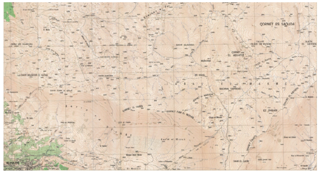
MAP OF MAKMEL AREA AND ITS RELEVANCE TO BCHARRI VILLAGE

The Makmel area is already a resort area where visitors and tourists come for skiing activities in winter and for good weather in summer. A good part of the local communities in the nearing villages live in their villages throughout the year; they rely on visitors for a large part of their income. The area has a substantial infrastructure for tourism with hotels, restaurants, roads, etc. Local communities are also initiated on nature protection in designated areas through the protection of the cedar grove in Bcharri; they also know the socio-economic potentials and activities associated with protection. The conservation activities in Makmel through this project will add another attraction to the existing socio-economic cycle and is estimated to be well welcome by the local communities since it enhances and enlarges the nature-based activities.