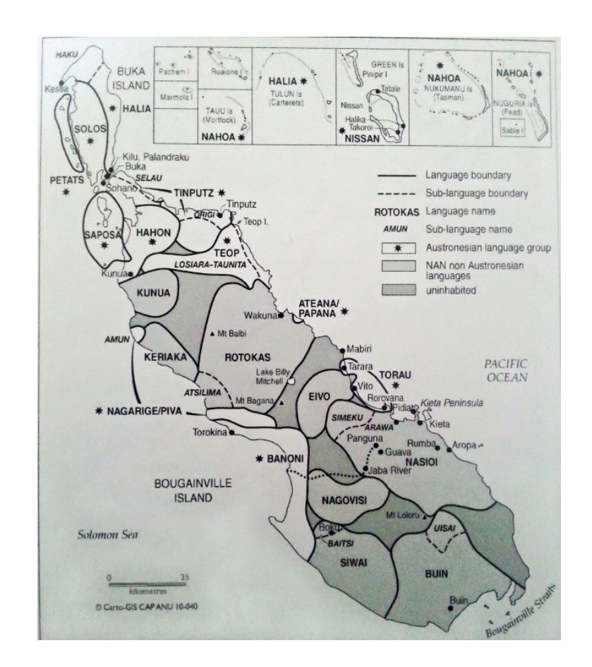
Figure 1: Languages of the Autonomous Region of Bougainville.

The Rotokas, Kunua, Torokina and Keriaka clans are generally found in Wakunai, Kunua, and in south Kunua and Torokina districts, respectively. The National Statistics Office estimated the populations of Wakunai (15,960 people), Torokina (4,376 people), and Kunua (16,236 people) districts (Table 1).