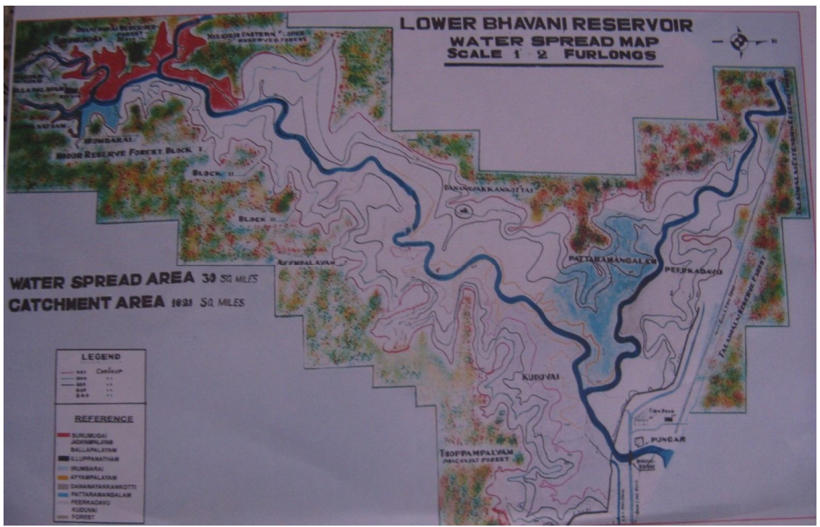
Map of the Bhavanisagar Dam and Reservoir (restricted): project team was allowed to take a photograph after much persuasion

The Bhavanisagar Dam and Reservoir into which River Moyar is drained is also known as the Lower Bhavani Dam. It is the second largest dam in the state of Tamil Nadu after Mettur, and also ranks as one of the biggest earthen dams of India. The construction of this dam was commissioned in the year 1948 and completed during 1955. Standing at a height of 32 m, the capacity of the dam is 32.8 tmc. The water spread area is 48.28 sq km, while the catchment area for the reservoir is 2608.746 sq. km.