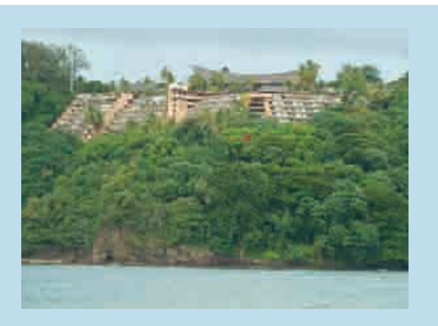
Abandoned ruins of a resort, French Polynesia, 2011 – Regulations for the decommissioning of buildings should cover restoration of sites.

A primary use of regulations to influence tourism impact is in the process for land use planning and control that requires prior approval to be granted before any new development or change of use can take place. All areas of vulnerable biodiversity should be covered by such a process. Requirements for notification of development, impact assessment and decisions on granting approval are looked at further in Section 7.