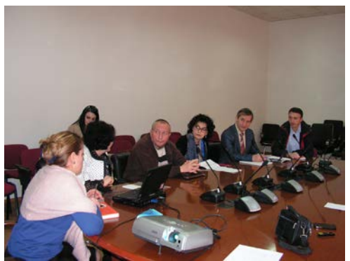
Figure 2. During the meeting in Environmental Ministry.

-The meeting organized in the Ministry of Environment on the 18<sup>th</sup> of March with representatives of the Ministries of Environment and Agriculture, The National Environment Agency, Agency of Protected Areas to present the results of the project and distribution of brochure has been a contribution for the new strategy for integrated management of Shkumbini River.