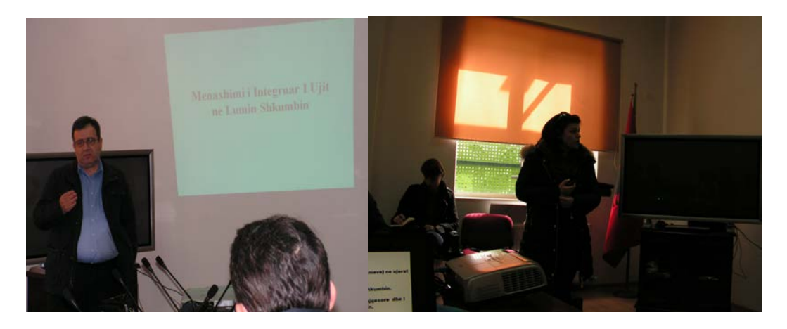
Figure 6. During training 4.

The government is partially funding the rehabilitation but will not fund any further investment in irrigation infrastructure. The WUOs will have to collect sufficient money from water users not just for annual maintenance but also for long-term expenditure to cover the costs of replacing structures as they deteriorate. The training programs cover the issue of long-term sustainability and financing of irrigation system.