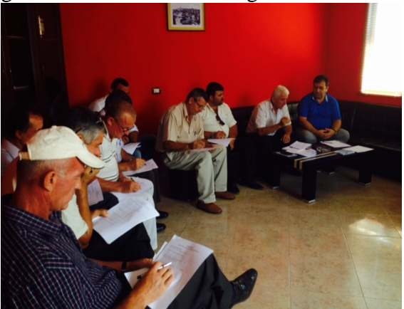
Figure 3. During training 1.

There are some procedures for planning the seasonal irrigation demand, which are not used effectively. As a consequence, the plan and situations do not correspond. The purpose of planning and its practical application were treated and have been shown to great interest in this training the WUOs staff.