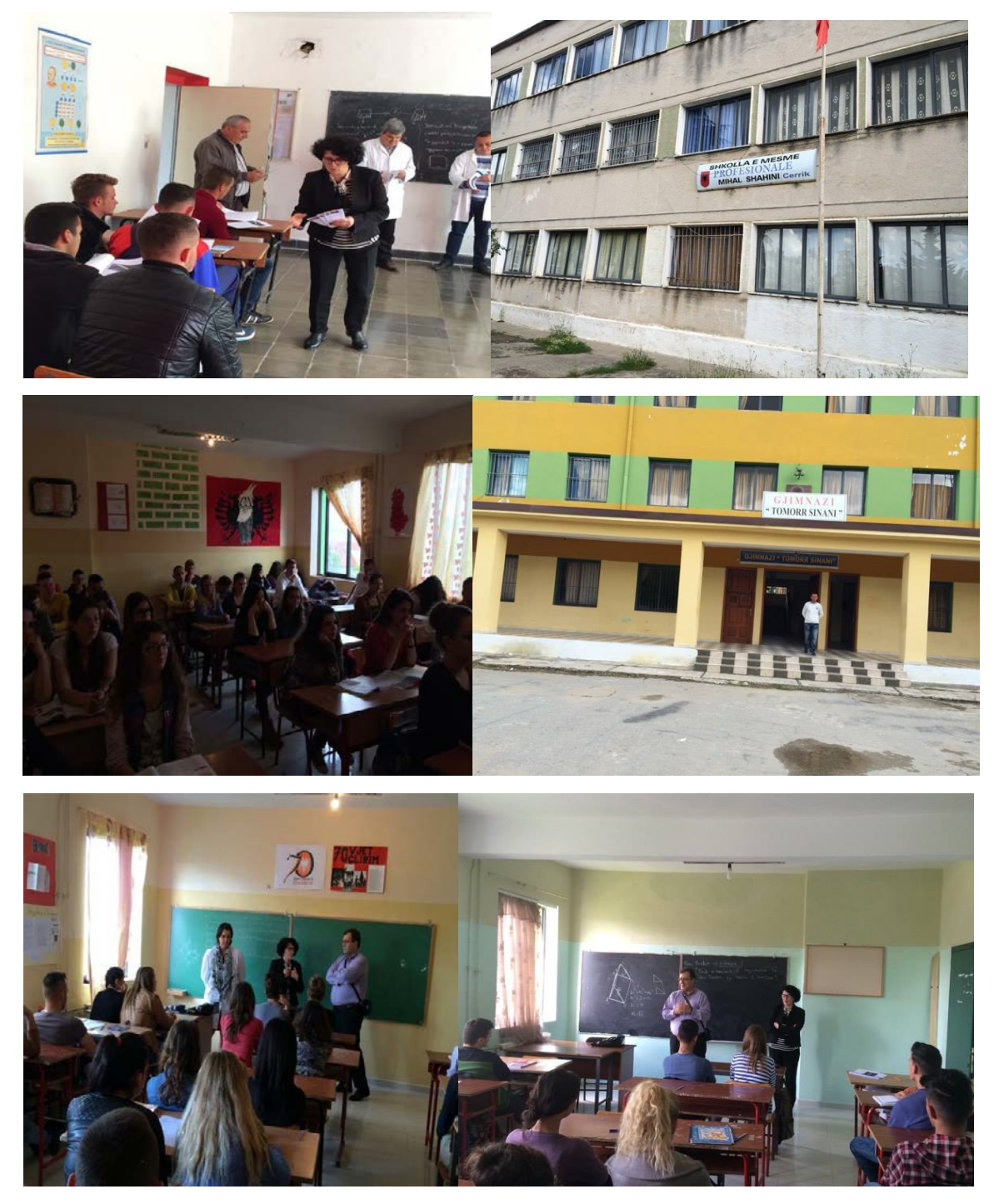
Figure 7: Lectures in professional and general high school of Shkumbini's region