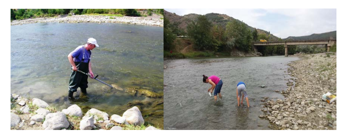
Figure 1. During sampling time in Shkumbini River (Dr. Spase Shumka, Dr. Lirika Dorri, Kupe)

Analysis of heavy metals in the river Shkumbin showed that the level of nickel is high in water and sediments along the Shkumbin. The highest values of nickel in water were in stations Lekaj (46 \mu g/L) and Peqin (40 \mu g/L) therefore not only influenced by the origin of ultramafic soils that are naturally rich in metals but and human pollution. In sediments collected along the Shkumbini River nickel concentration is high ranged from 500 to 750 mg/kg dry weight. Construction activities cause short-term effects, but subsequent erosion of ditches and slopes may cause more serious long-term effects if not mitigated.