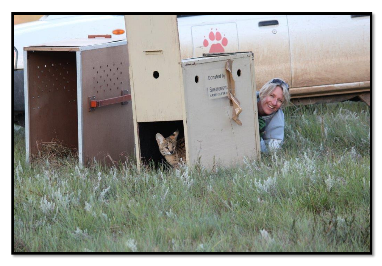
Above - Relocation of a rehabilitated Serval to a candidate stewardship site.

Many other associated biodiversity and flora will be conserved as result of the declaration of sites. Many of our sites such as Hebron and Hebron East have exceptional floral and amphibian diversity that is in need of protection.