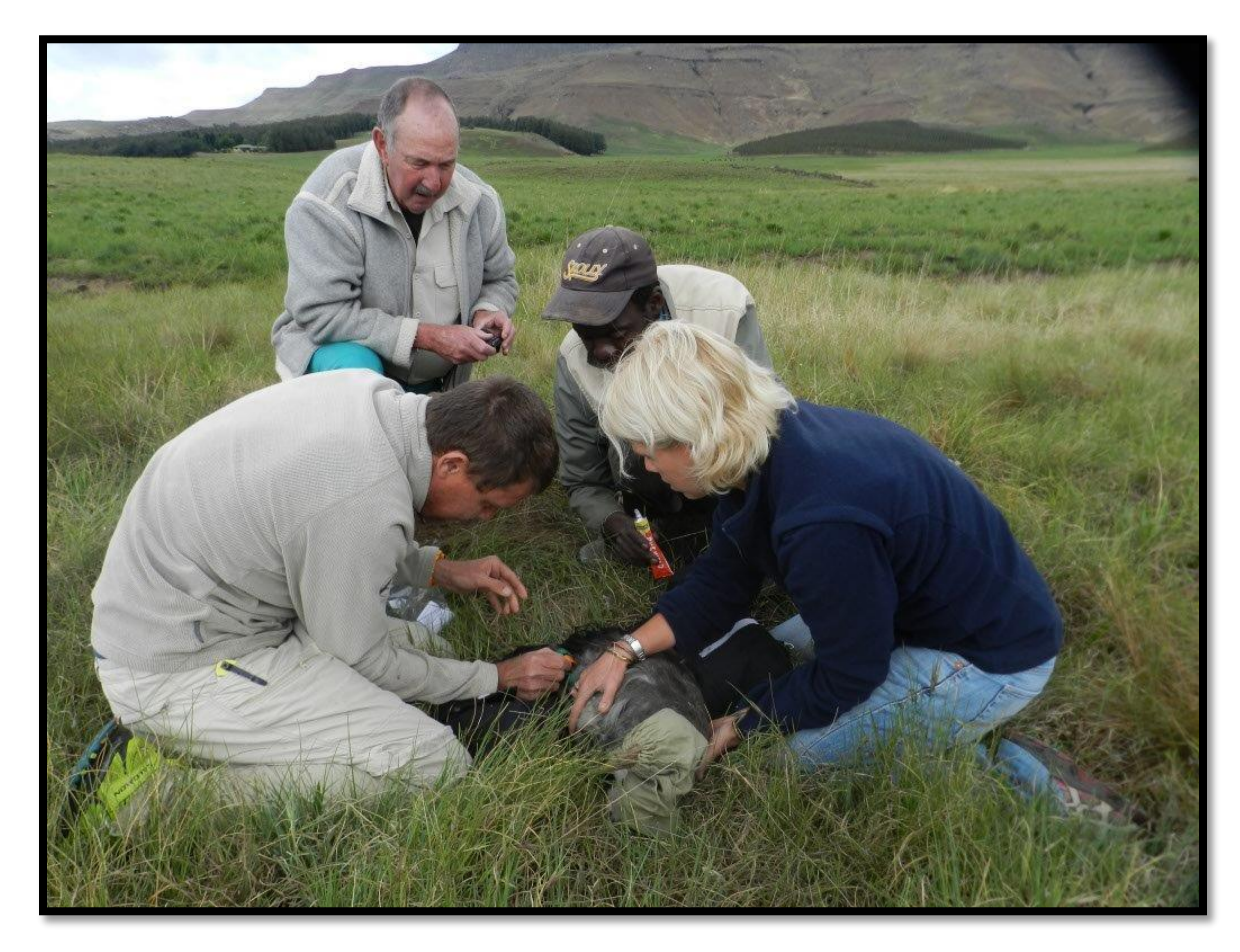
Above – involving landowners in crane conservation is a great motivator.