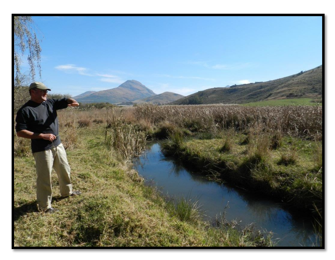
Above - A farmer speaks about the value of his wetland in the Kokstad area.

8) Interaction with more than eight local schools on crane and wetland conservation (schools in Underberg, Kokstad, Matatiele and Cedarville. Many landowners involved in the programme have their children attending St Patrick's School, repeated interaction with the school reinforces The Endangered Wildlife Trust's commitment to the area and helps to build and reinforce trust. See component reporting).