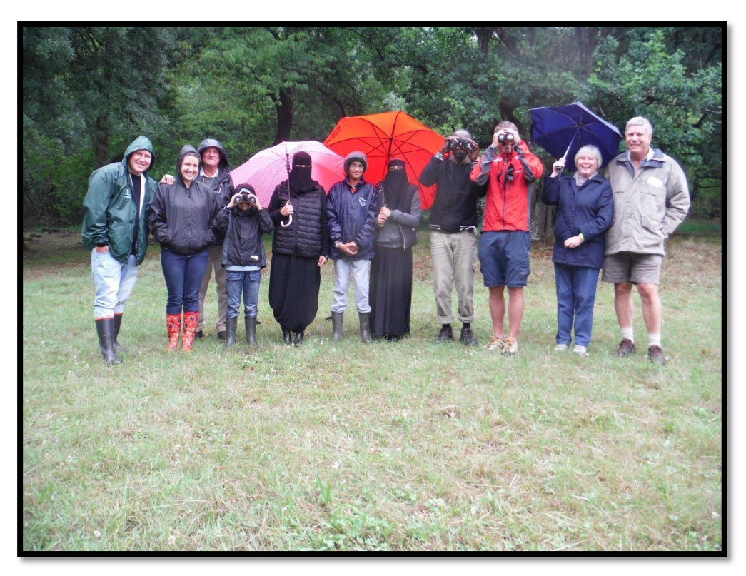
Above – Wetland walk with members of the public at Penny Park – East Griqualand Encounter.