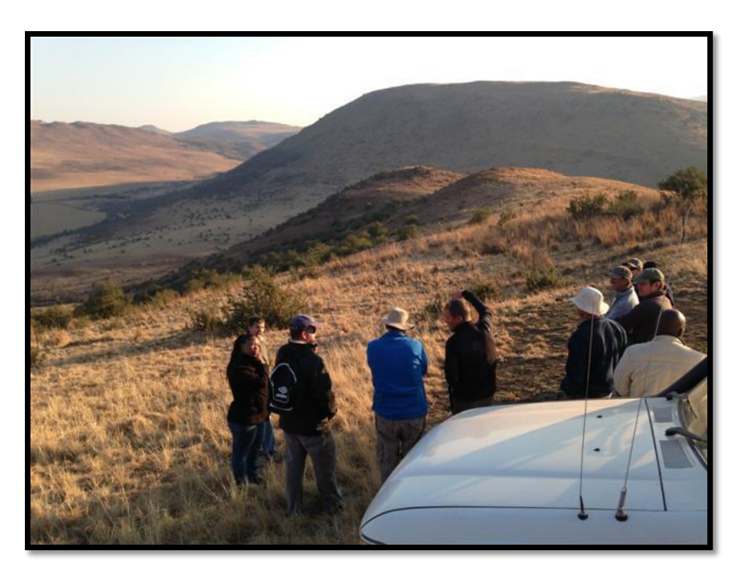
Above - meeting with Cedarville Farmers on the Cedarville Protected Environment