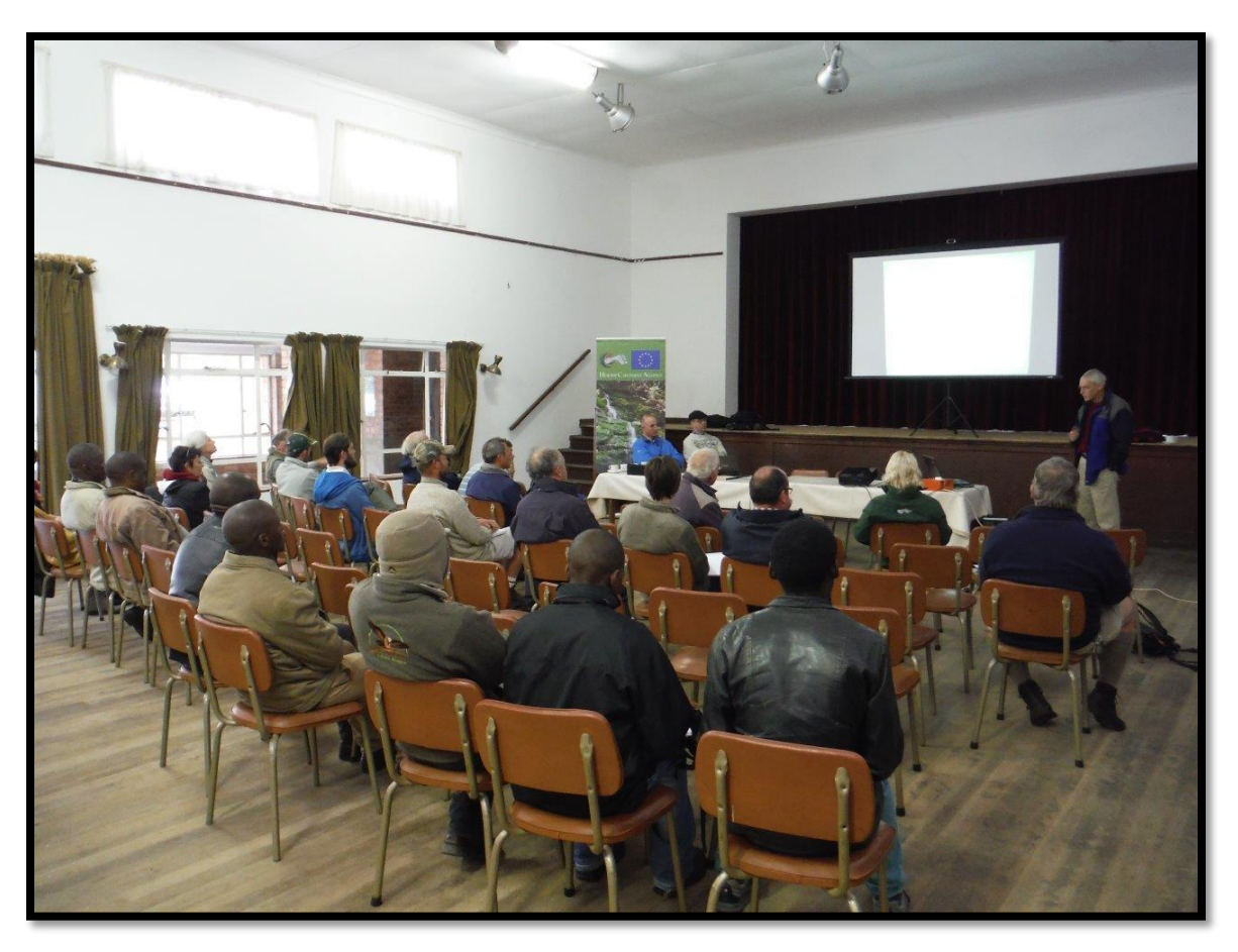
Above - EWT Learning Series - Part 1 - Sustainable energy and Agricultural solutions