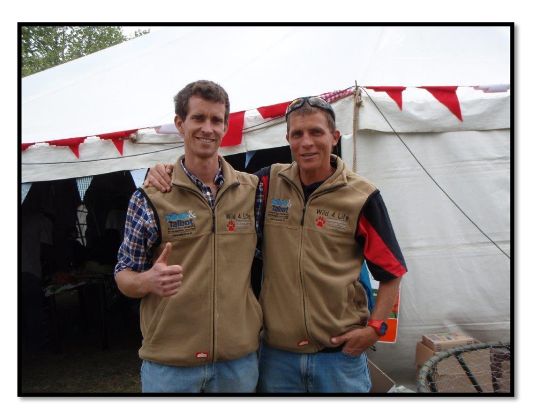
Above – Stewardship jackets sponsored by Talbot & Talbot – a large water testing company – proudly worn by landowners involved in the stewardship project.

They have also led to the roll out of small scale incentives such as the providing of stewardship apparel to landowners, provision of trap camera's to farms and the provision of pro-bono legal advice where possible.