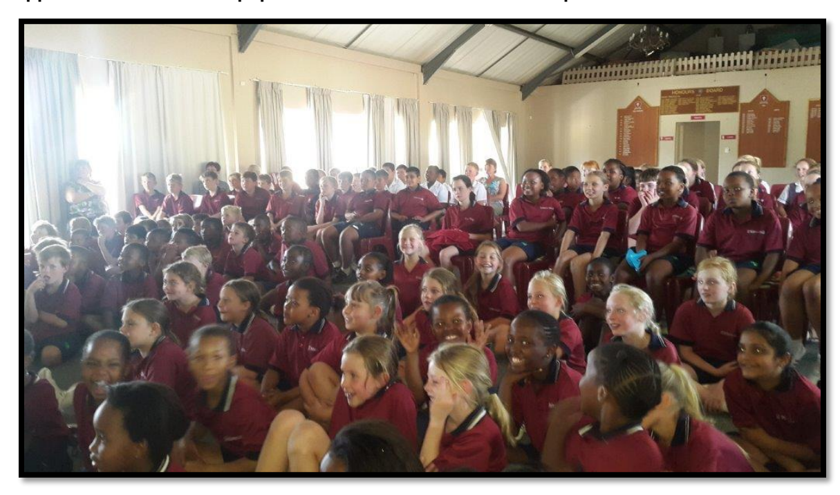
Above - Talk at St Patrick's School - Kokstad.