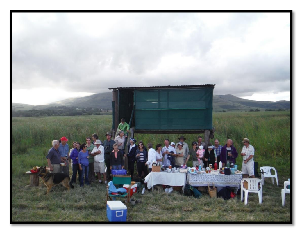
Above - Wetland picnic at Penny Park 2013