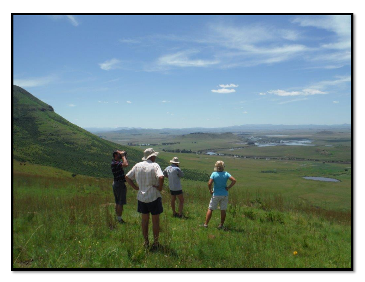
Above - Site Assessments at Cedarberg Farm - part of the Cedarville Protected Environment.