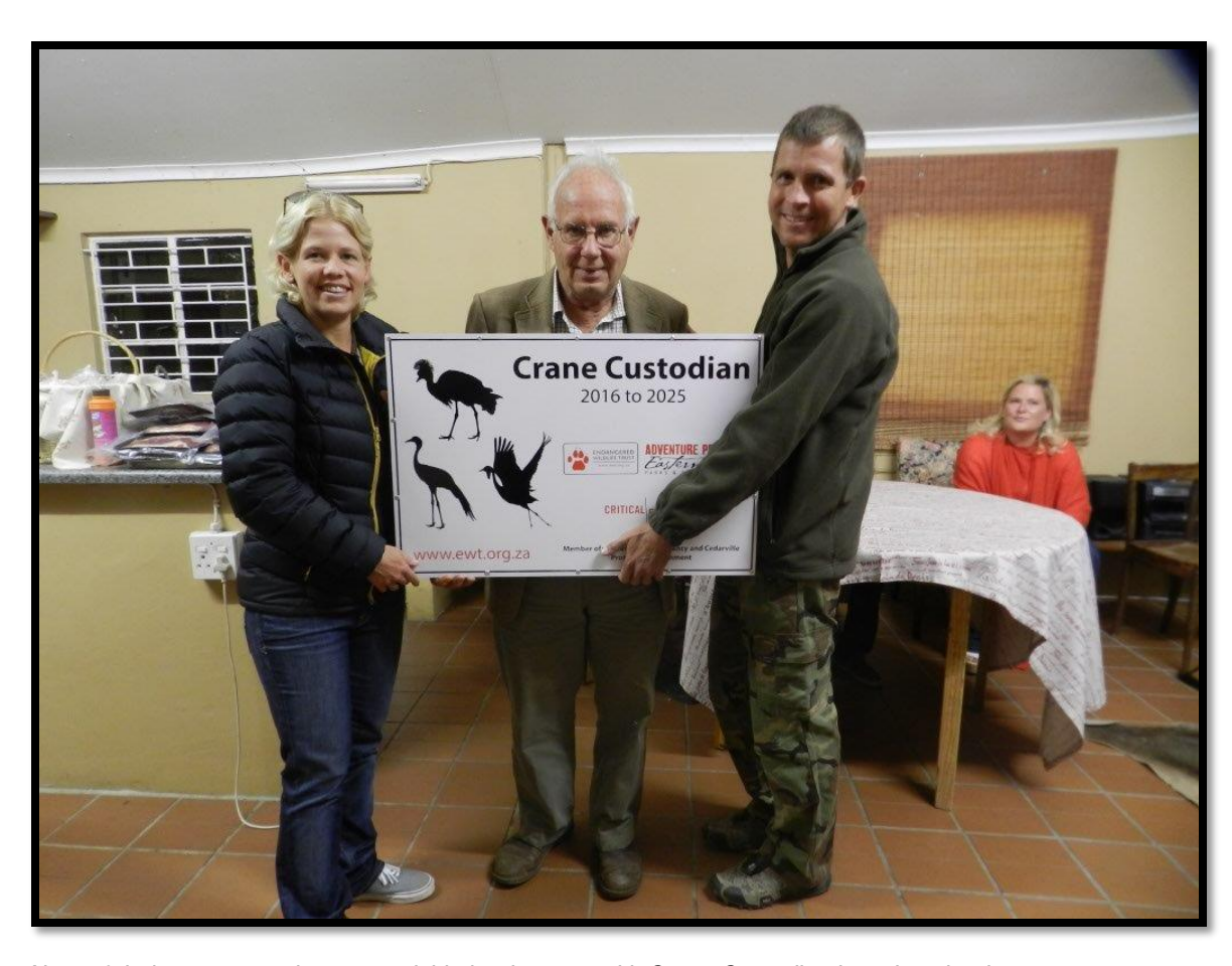
Above & below – presenting stewardship landowners with Crane Custodian boards to landowners.