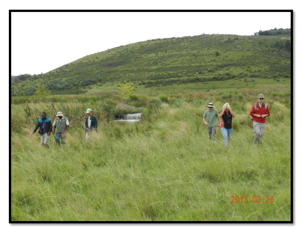
Above - Site assessment at Penny Park.

These teams were coordinated by the project facilitator for this project and typically included individuals from the following organizations.