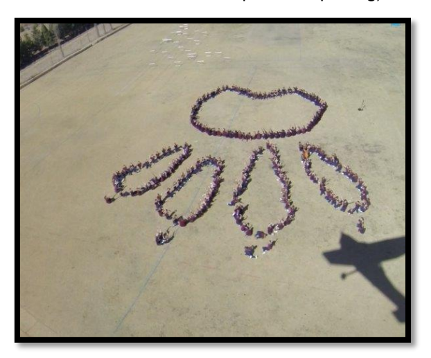
Above - a giant EWT logo made by pupils at St. Patrick's school in Kokstad to celebrate 21 years of aerial surveys.

8) Interaction with more than eight local schools on crane and wetland conservation (schools in Underberg, Kokstad, Matatiele and Cedarville. Many landowners involved in the programme have their children attending St Patrick's School, repeated interaction with the school reinforces The Endangered Wildlife Trust's commitment to the area and helps to build and reinforce trust. See component reporting).