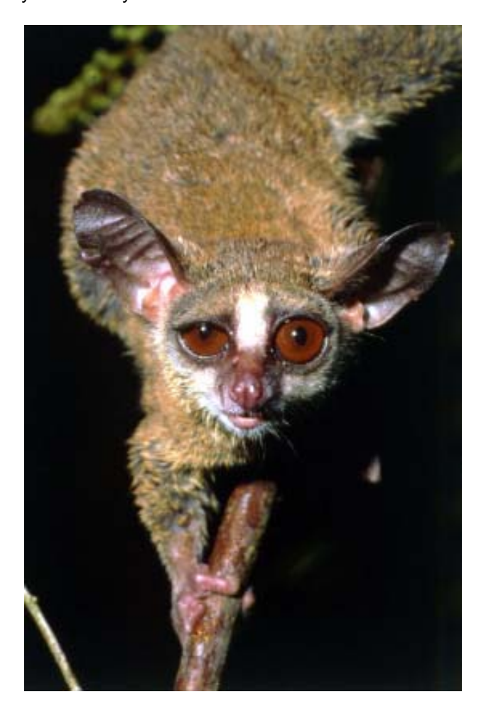
Figure 1. Adult Kenya coast galago Galogoides cocos in Arabuko-Sokoke Forest, Kenya.