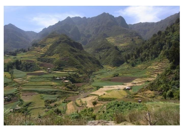
The view of the lodge