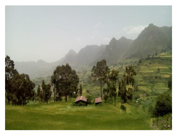
Mountain chains viewed at the campsite

rather than returning to the same trek. The trekking will be alongside to the gentle forest of Wof Washa Natural Forest.