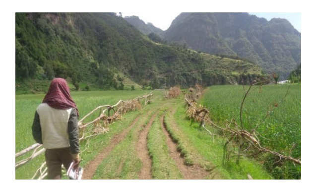
Trekking root towards the lodge

Liq-Marefiya lodge is located in Ankober Wereda in altitude of 2498masl across the Ankober Palace lodge in a distance of 12km off to the main road. There is an access of road to use vehicle. The place has got its name by the late 19th, while the then king of Ethiopia, Menelik II, has let the intellectuals, mainly the foreigners, to live in this area. Hence, the name of the area has been driven from the presence of the intellectuals. To cement this story, you can find the Tomb of a well-known Italian geographer and explore, Antinori. It is also a place where Jewish people, called Falasha communities, mean the exodus from Israel are living. In addition, there are amazing and interesting gifts in the area like caves available in the forest, small ponds with many birds living, the ruins of first Flour Mill and Mortal Machine found. From this campsite, it is also possible to make the trekking inside the jungle forest towards Wof Washa Genet or Mescha as well.