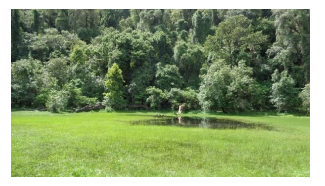
The epicentre of the forest trekking root

Mescha lodge is known as the place where 'Miracle Food That Saved the People of Mescha, /Manna/', like a miracle Mosses has received from God a supernatural food. Hence, the name has driven from this episode. It is located in one of the rift valley lines of the KBA with altitude of 2794masl. The campsite is adjacent to the forest with possibility of observing fascinating landscape, watching birds and also seeing of wildlife. In addition to this, area is very known by the 'Map of Ethiopia' depicted inside the forest, alleged to be in drawn in the late 19th century. It has a distance of 13km from the main road off and possibly used to walk through the valley either on foot or possibly use horse. You can back to Wof washa genet or Goshu-Meda lodge,