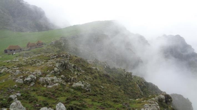
View of Goshu Meda