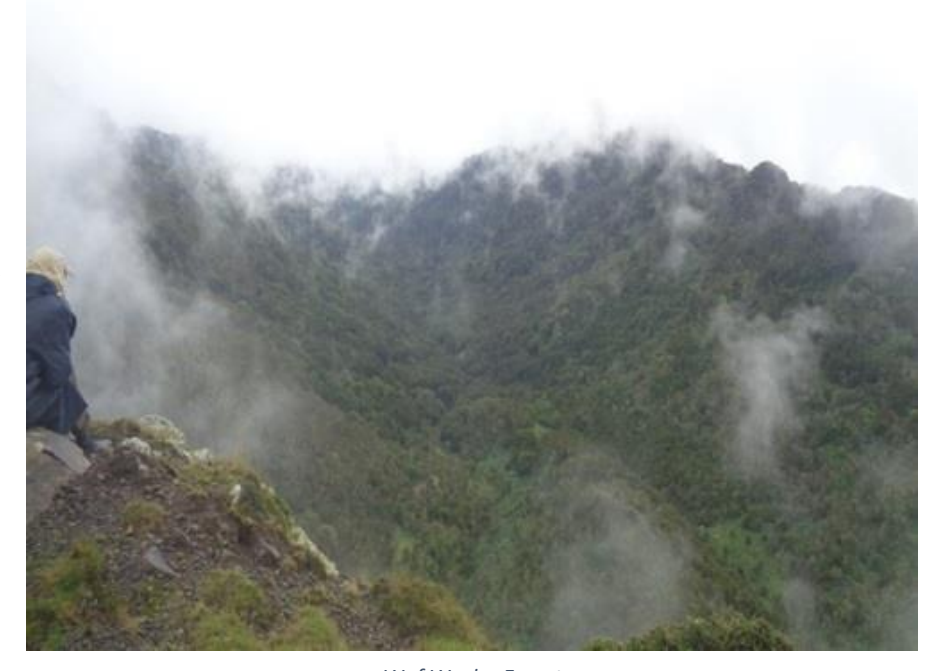
Wof Washa Forest

This KBA supports the only known population of Vulnerable Ankober Serin Crithagra ankoberensis, a species confined to areas between 2,800 m and 3,750 m along the escarpment. The site also hosts the famous Gelada Baboon Theropithecus gelada and potentially (not seen for a long time!) the even more famous, though Endangered, Ethiopian Wolf Canis simensis. A decade ago, the forest cover was more than 16,000ha. Now, it is