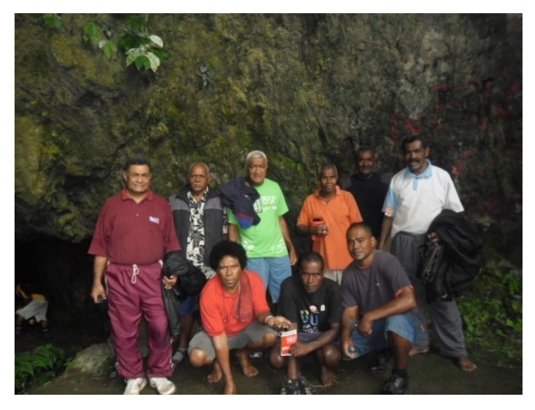
Figure 2: Members of the tour group at the entrance of the Wailotua bat caves, with the Tui Wailevu (standing 4th from left).

The group had morning devotion at 6am and breakfast at 7am and were informed of the tour into the cave. The group were then divided into their respective four groups, assigned with their tour guide and given the instructions of what to expect inside the cave.