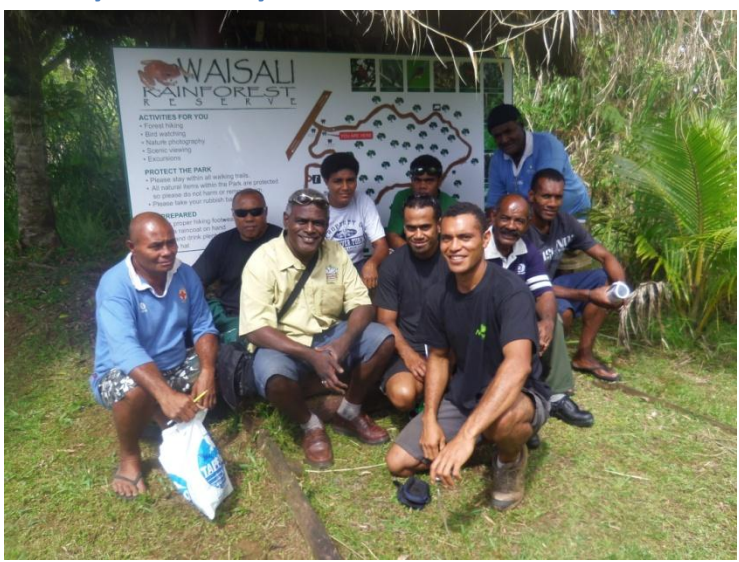
Figure 1: Members of the tour group at the Waisali Forest Park