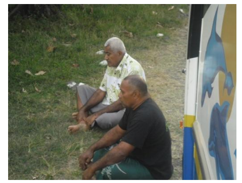
Figure 4: Members of the tokatoka Nabuya, in Drauniivi Village (LHS) presenting the 'ivakasobu' (traditional welcome) to the elders of the tour group (RHS)