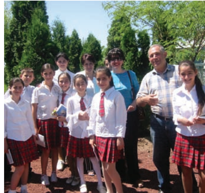
ATP provides environmental education lessons to thousands of children and adults.

ATP's Environmental Education Curriculum: http://www.armeniatree.org/whatwedo/eea.htm