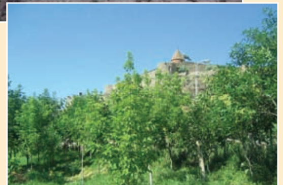
Khor Virab before ATP began planting there in 2001 (top), and the same site in 2006