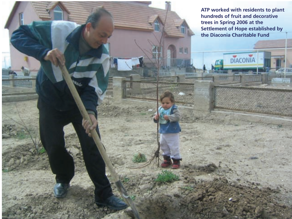
ATP worked with residents to plant hundreds of fruit and decorative trees in Spring 2006 at the Settlement of Hope established by the Diaconia Charitable Fund

“A large number of families pay their expenses because of ATP. There are people out there who earn income by selling wood and even exporting timber, but I am opposed to logging so I got involved in forest restoration. And not only to provide income and improve the ecological situation in the country,