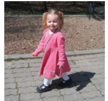
Children from Quality Schools International of Yerevan participated in a walk-a-thon and other activities to support ATP’s mission to reforest Armenia