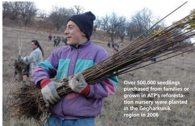
Over 500,000 seedlings purchased from families or grown in ATP’s reforestation nursery were planted in the Gegharkunik region in 2006

ATP’s Community Tree Planting (CTP) Program, which has been our flagship operation since 1994, organized and conducted planting initiatives at 129 community sites in every region of Armenia in 2006,