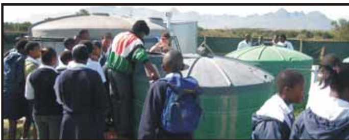
TOP LEFT: Contrasting technologies – Oscar Mpetha students from Nyanga visiting Koeberg where watts and money are at the mega level.