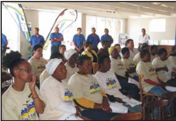
Hout Bay Certificate Ceremony 29 Feb 2008

As the Hout Bay Coastcare project drew to a close the team looked back and reflected on what was achieved. The project encompassed setting up vegetable gardens at the YMCA, which provided food for the "Y", and for the team members themselves. The ablution blocks were maintained in a clean and presentable state for the duration of the project. The beaches, Disa River estuary and adjoining streams were kept clear of litter and other refuse generated by the more wasteful aspects of urban living. This project in particular, received positive feedback from the general public in the form of several compliments.