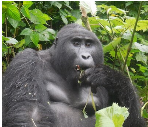
Endangered silverback mountain gorilla ( Gorilla beringei ssp. beringei ) in Uganda.