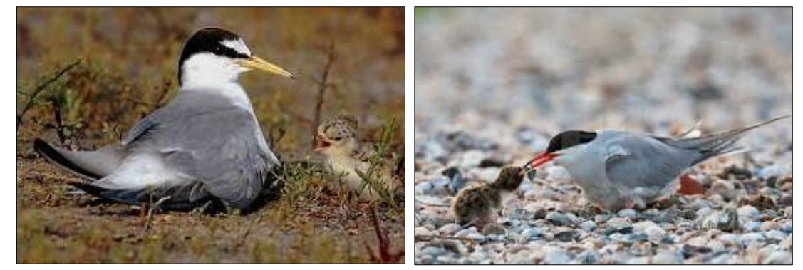
Figure 3. Little Tern Sternula albifrons and Common Tern Sterna hirundo

Both habitats are present at the Natural Park but during the last 20 years the fragile islands of Karavasta lagoon have become the only reliable nesting place for colonially nesting terns as the other suitable habitats, the sandy bars separating the lagoons from the sea, are very often subject of intense human disturbance or predation from feral dogs, cats and rats.