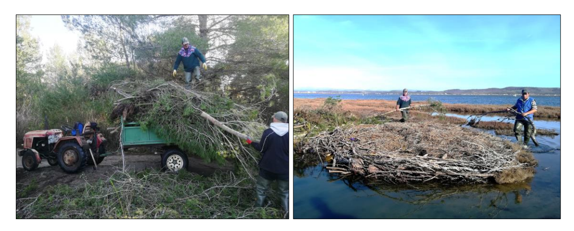
Figure 2. Collection, transport and placement of nesting materials in the reproductive beds