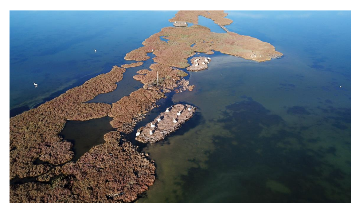
Figure 1. Reproductive beds before the breeding season

Reproductive beds are breeding platforms built in the Pelicans' island in order to avoid flooding of the breeding colony and saving thus both embryos and chicks from drowning (Fig. 1). The use of reproductive beds has started, in an organized way, since 2014 when flooding events became numerous and were limiting the breeding success of the Pelicans' colony.