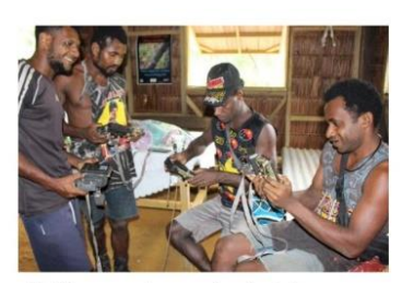
(a)Camera trap setup training