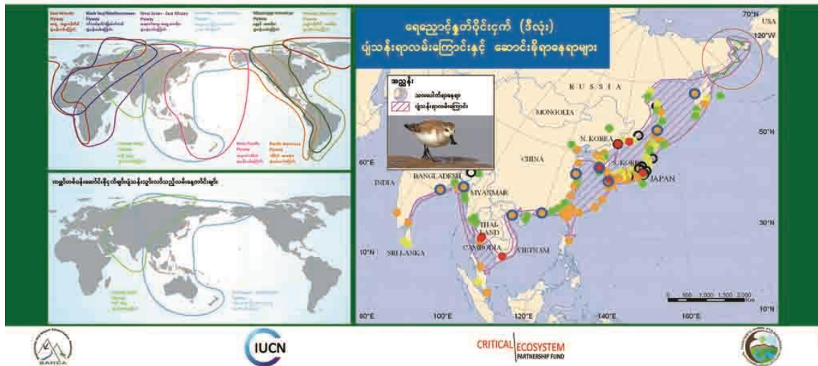
Fig1: Global Flyway sites and Spoon-billed Sandpiper migration route

ကမ္ဘာတစ်ဝန်း ဆောင်းရိုငှက်များ ပျံသန်းသွားလာသည့်လမ်းကြောင်းများ