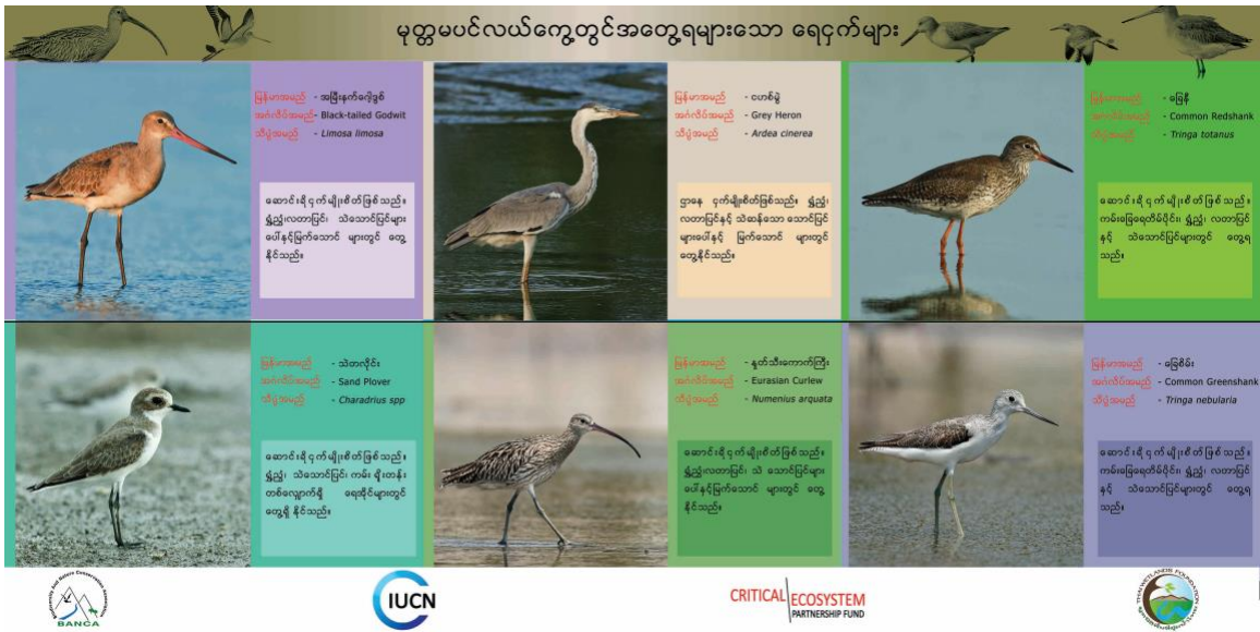
Fig4: Common species in Gulf of Mottama