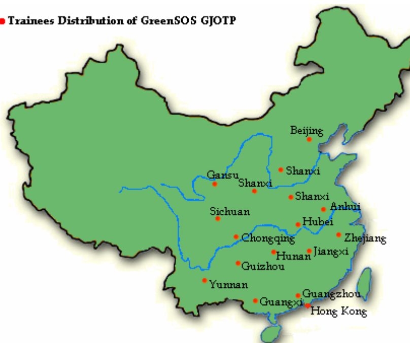
● Trainees Distribution of GreenSOS GJOTP