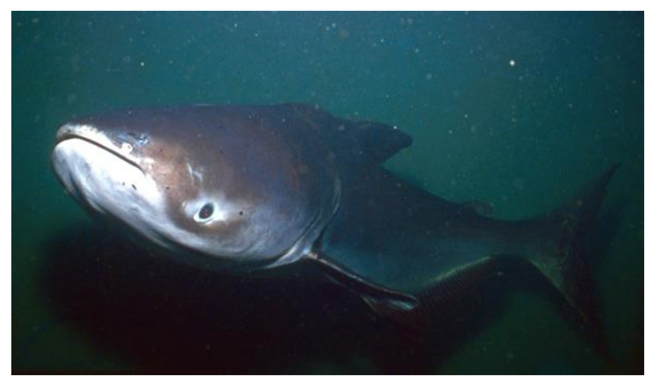
The Mekong giant catfish is one of the largest and most endangered fish in Southeast Asia. This photo of a captive Mekong giant catfish was taken in an aquarium in central Thailand.

The purpose of this report is to provide an up to date review of the status of the Mekong giant catfish, including information about the ecology of the Mekong giant catfish, threats to the species, an overview of past and current conservation measures and recommendations for future action.