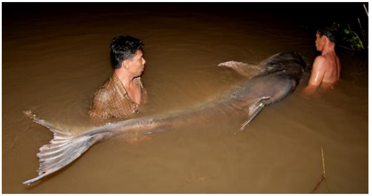
Mekong giant catfish captured in the dai fishery on the Tonle Sap River. This fish was tagged and released as part of the Mekong Fish Conservation Project's activities focused on protection and study of the Mekong's large-bodied, endangered fish.

The Ban Hat Khrai Fishermen's Club in northern Thailand has kept detailed records of Mekong giant catfish catch since 1986. From 1986 until 2011 at least 412 adult Mekong giant catfish were captured in northern Thailand (Chiang Rai Province near Chiang Khong) and Bokeo Province, Lao PDR. The Ban Hat Khrai Fishermen's Club catch records are the best long-term data set available on the abundance of Mekong giant catfish. The Giant Catfish Fishermen's Club also kept records of the number of fishermen participating in the fishery, the length of the fishing season, and the total catch. The data suggests a decline in the abundance of Mekong giant catfish over the past 25 years.