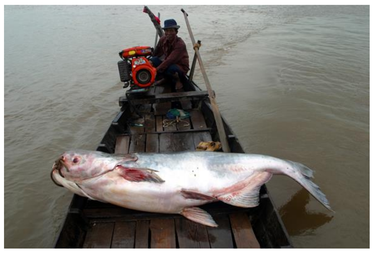
A Mekong giant catfish that was captured in the dai fishery of the lower Tonle Sap River on October 21, 2002. The dais, or bagnets, are large cone-shaped nets that catch fish as they move out of the Tonle Sap Lake and into the Tonle Sap River and mainstream Mekong. Dais are not selective in terms of the fish that they catch and and so sometimes catch endangered species like Mekong giant catfish and giant carp as by-catch. These fish are often injured when they are caught and sometimes die before they can be released.

The giant Mekong catfish is an important and charismatic species (Kottelat and Whitten 1996). As a flagship species, the giant catfish symbolizes the ecological integrity of the Mekong River and other freshwater ecosystems in Asia. Thus, the successful recovery of these species is an important part in the sustainable management of the Mekong River Basin.