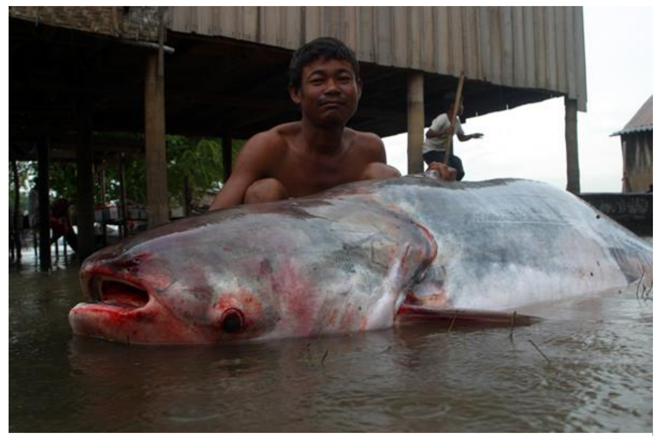
This Mekong giant catfish was also caught in the dais, or stationary bagnets, of the lower Tonle Sap River. In recent years, fishermen who operate the dais have agreed to release Mekong giant catfish when they are caught in their nets.