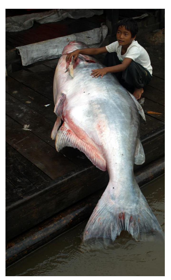
Mekong giant catfish captured at the dais, or floating bagnets, in the Tonle Sap River, Cambodia. Several Mekong giant catfish are captured each year in the Tonle Sap River, usually in October and November as the floodwater recedes, the Tonle Sap Lake empties, and fish like the Mekong giant catfish move from the flooded areas of the lake to the mainstream Mekong River.

While the exact population size and population trend of Mekong giant catfish is unknown, efforts have been made to estimate population size and trends based on catch records. Most notably, Lorenzen and Sukumasavin (2007) developed a mathematical model to reconstruct Mekong giant catfish dynamics since 1970. The model estimates spawner population size at 240 fish prior to 1983 (Lorenzen and Sukumasavin 2007). Lorenzen and Sukumasavin (2007) further state "intensification of the Chiang Khong / Houy Xai fishery then depleted the population by 80% to just 50 in 1995. The model predicts that the population has since recovered significantly, largely due to maturation of fish that were spawned prior to 1990. Lorenzen and Sukumasavin (2007) estimate current spawner