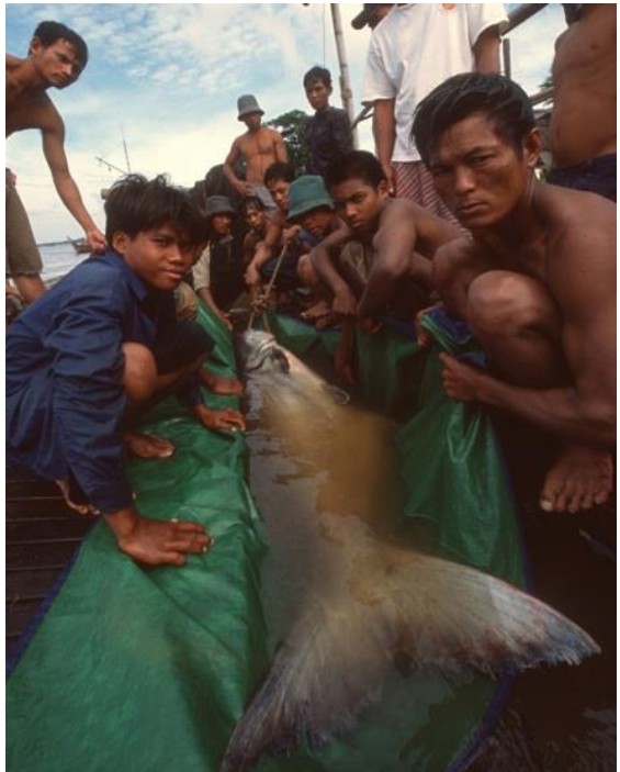
Mekong giant catfish caught in the Tonle Sap River dais.The Tonle Sap Lake and River, and Mekong River between Vietnam and northern Thailand and Lao PDR represent the limit of distribution of Mekong giant catfish at this time.

Artificial propagation can be used to increase the population size of endangered species like the Mekong giant catfish. In fact, breeding programs have the potential to produce millions individuals for release into the wild and, in the case of rare species, this influx of artificially produced individuals can increase the population size substantially. Even so, the impacts of such supplementation programs are not necessarily beneficial.