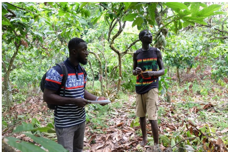
Figure 2: Internal inspection of a cocoa farm by YGL Extension officer

The first two audits took place in May 2020 and August 2021. They focused on farm visits, farmers' general knowledge and understanding of organic regulations, cocoa drying methods, storage and documentation. Few non-compliances were identified during the audits and addressed within the appropriate timeline by YGL team and the farmers. We consider that being approved in audit is an indicator of implementing good practices on the farm. Therefore, 412 cocoa farmers have been successfully empowered and respect good agricultural and sustainable practices.