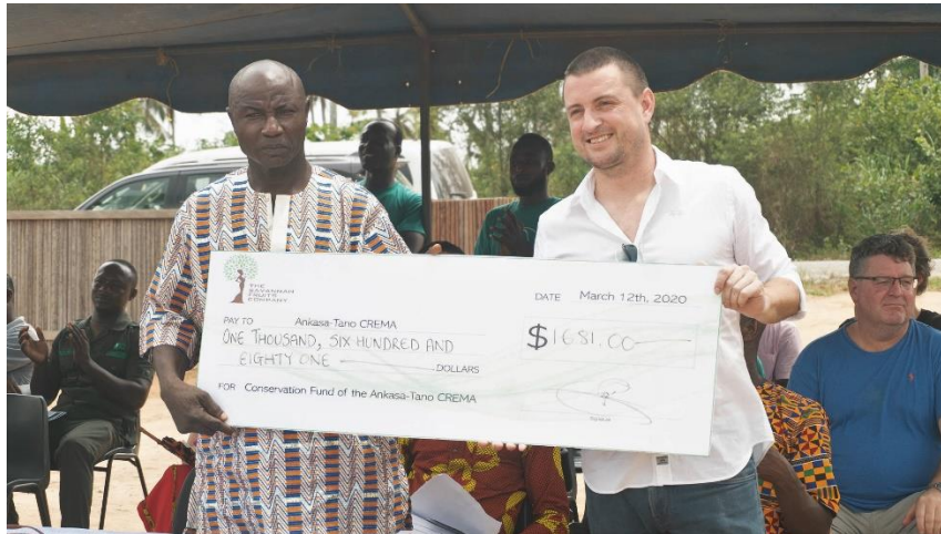
Figure 4: First Conservation Premium paid by SFC and received by the Ankasa-Tano CREMA Chairman

the conservation fund in 2020. The next settlement covering both 2020 and 2021 premium should bring about 1,700USD on the Conservation Fund.