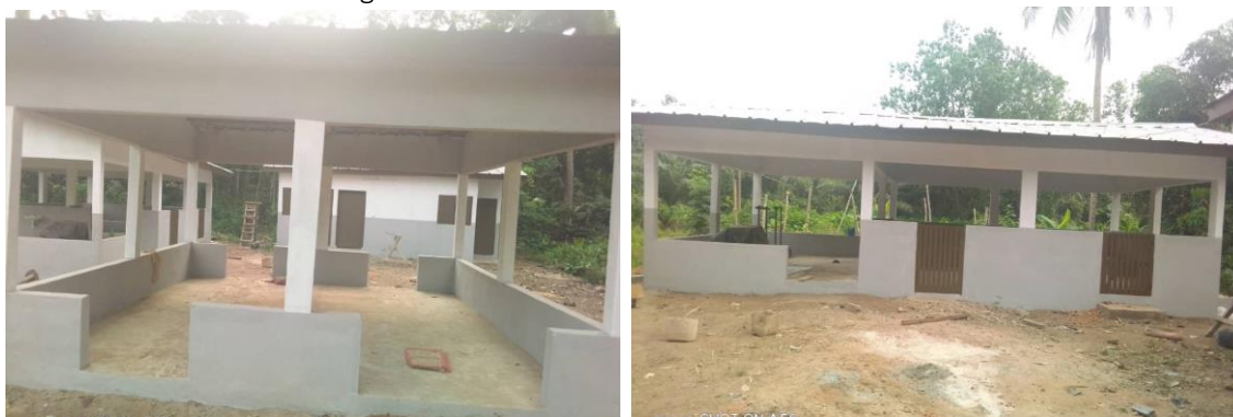
Figure 6: General view of the Gari processing unit (left) and view of the humid and dry areas (right)

This processing unit was built in 2021 and include a peeling shed, a humid area with shredding machines and presses, a dry area with improved stoves, an office and storing room. The centre is yet to be connected to the national grid but it does not