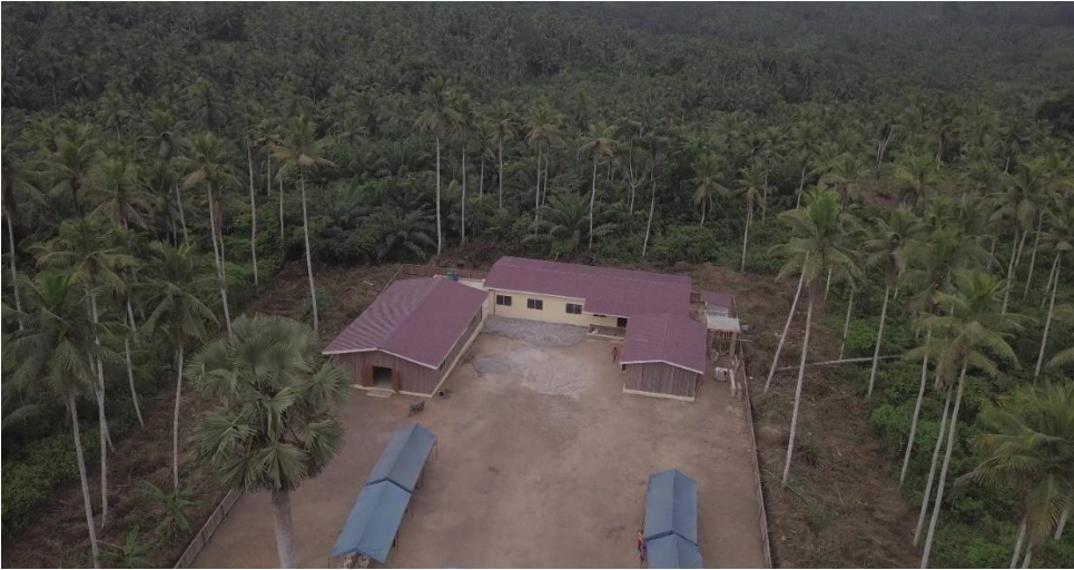
Figure 3: Aerial view of the Ellenda VCO processing centre after completion (2019)

made on logistics and budget, Modern Planners was selected for the work. The construction was completed at the end of 2019.