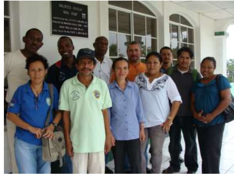
Figure 2. Assessment Workshop in Bluefields, Nicaragua