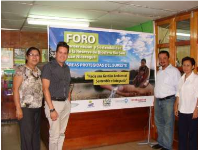
Figure 3. FUNDAR staff