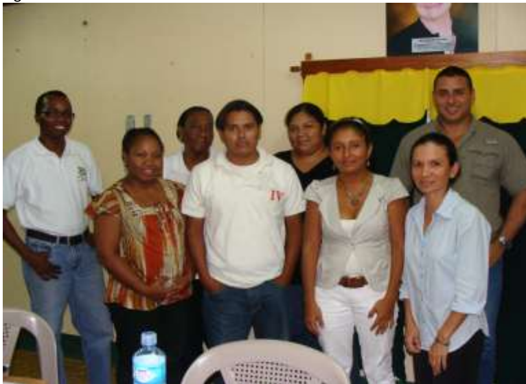
Figure 5. URACCAN staff