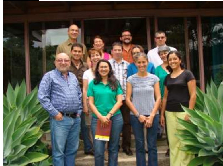
Figure 3. Workshop in San Jose