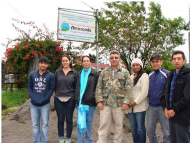
Figure 8. FUNDICCEP staff