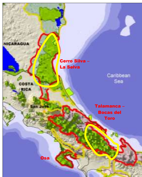
Figure 1. CEPF Priority Conservation Corridors, 2002 to 2006 in red. CEPF consolidation funding, from 2008 to 2012 in yellow.

To address the needs and priorities of the region, CEPF's investment strategy aimed to strengthen management in priority protected areas and to create sustainable livelihoods and land management practices in buffer zone communities. During its first phase of grant making from 2002 to 2006, CEPF awarded 74 grants for $5.5 million. Grant making was guided by the Southern Mesoamerica Ecosystem Profile and centered on priority sites in southeast Nicaragua, Costa Rica and western Panama, in three conservation corridors as depicted in Figure 1. Conservation International's Southern Mesoamerica Regional Office served as the coordination unit.