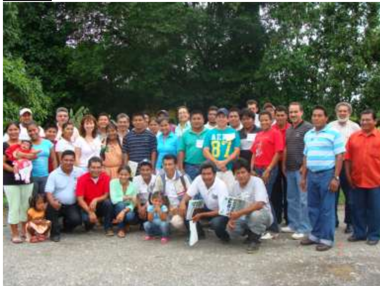
Figure 6. Workshop participants in Changinola